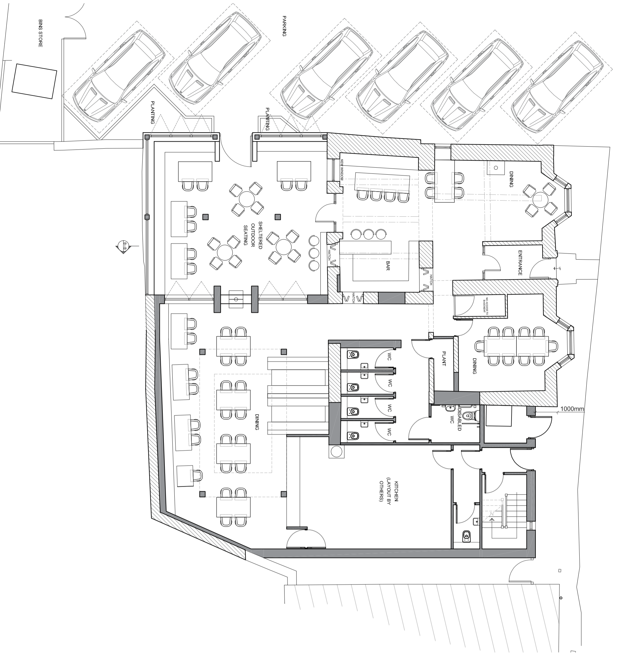
PROPOSED GROUND FLOOR PLAN SCALE 1:100

The drawing is to be read in conjunction with all relevant Architect, consultant and specialist drawings and specifications. The Architect is to be notified of any errors and omissions in the drawing as soon as possible. All work carried out before Planning and Building Permission has been granted is at the contractor's risk. Note: proposed drawing based on OS map information. All measured dimensions are approximate and all the dimensions are to be checked on site and subject to site survey.