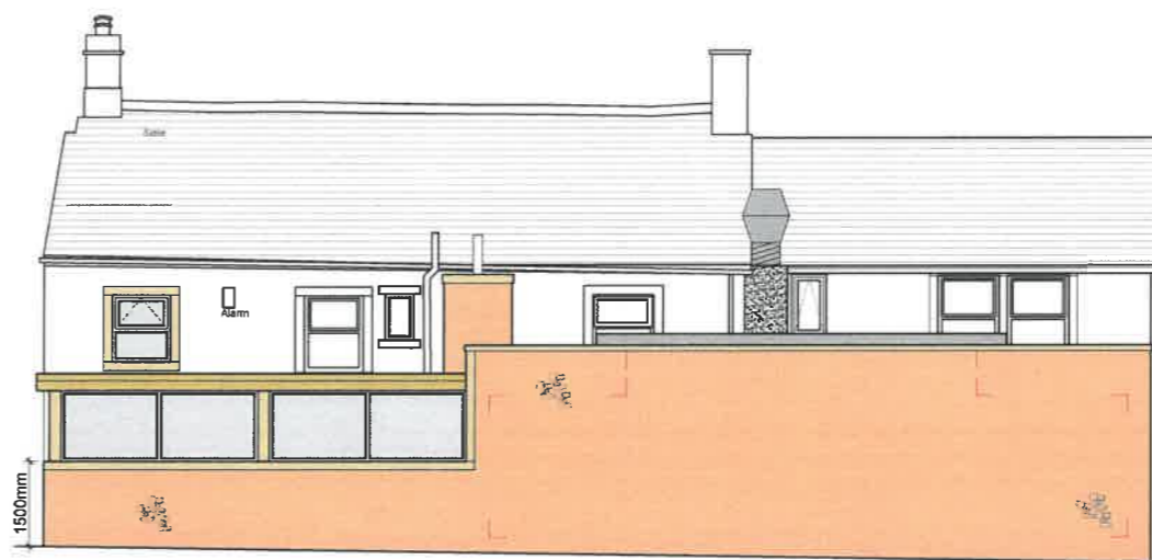
PROPOSED SOUTH EAST FACING ELEVATION SCALE 1:100