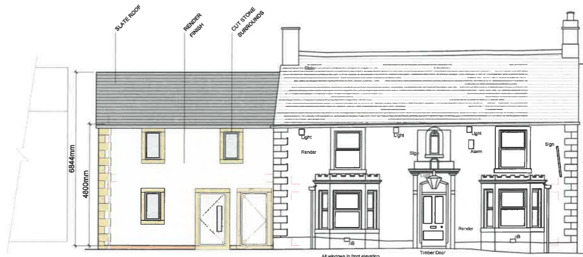
PROPOSED NORTH WEST FACING ELEVATION SCALE 1:100