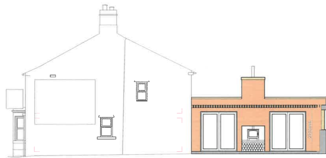
PROPOSED SECTION B-B SCALE 1:100