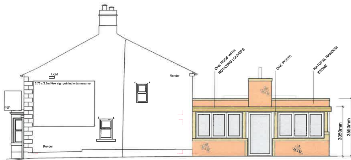
PROPOSED SOUTH WEST FACING ELEVATION SCALE 1:100