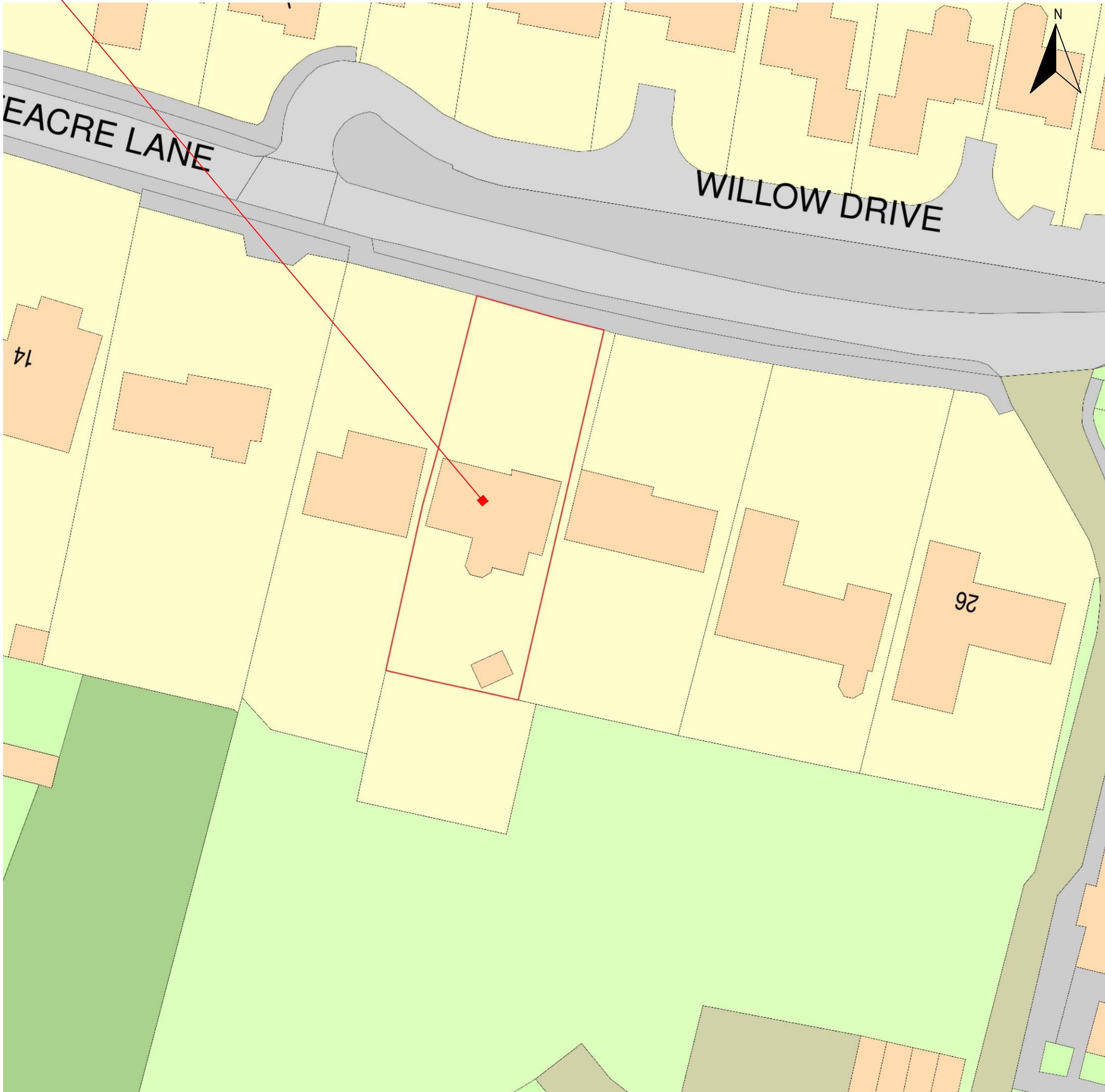
EXISTING SITE PLAN Scale 1:500