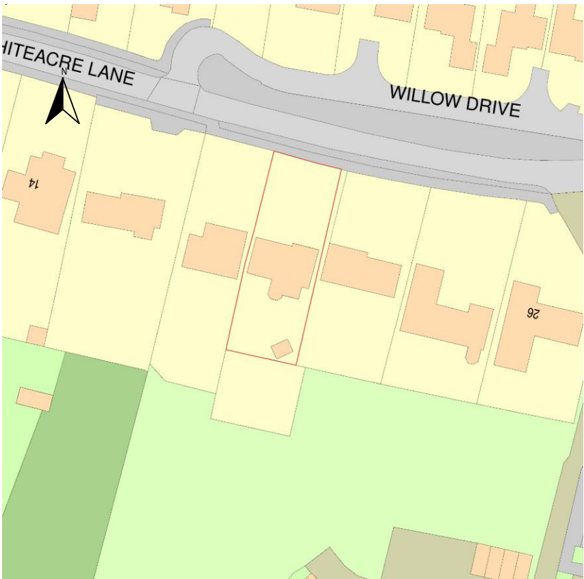
EXISTING LOCATION PLAN Scale 1:1250