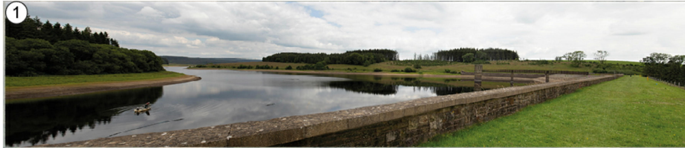
View of southern end of Stocks Reservoir. Image to illustrate the landscape character north of the development site: managed coniferous plantations and areas of broadleaf planting.