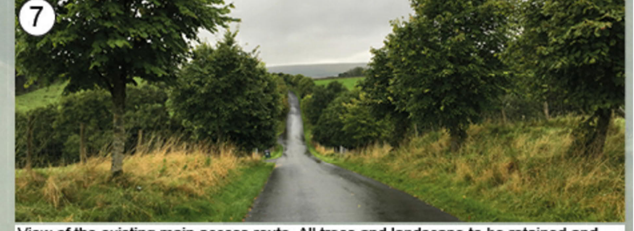
View of the existing main access route. All trees and landscape to be retained and protected in this location.