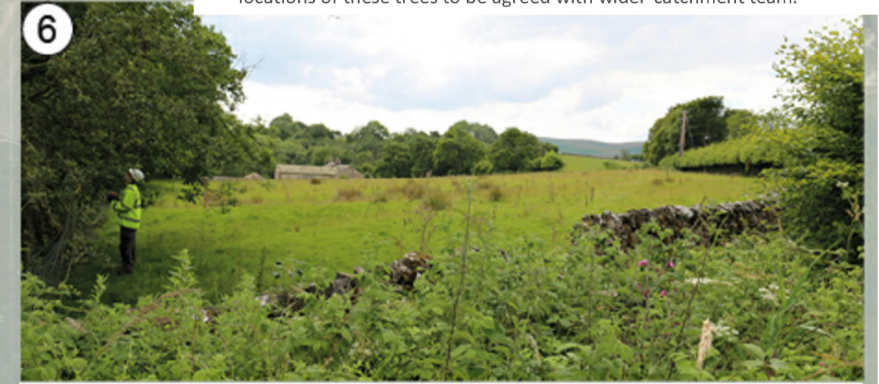
View of proposed compound location adjacent to existing site compound.