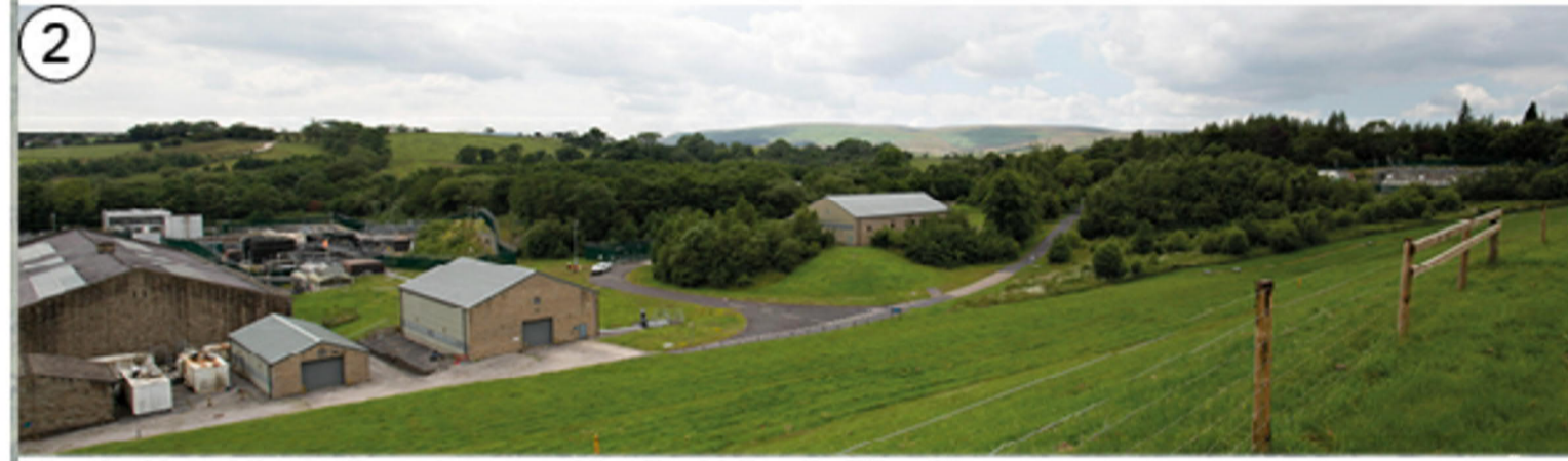
View looking at the north-east corner of the Rapid Gravity Filter Site. Image illustrates the expansive built form set out across the water treatment works site.