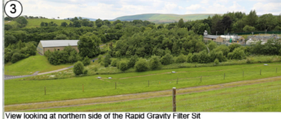
View looking at northern side of the Rapid Gravity Filter Site