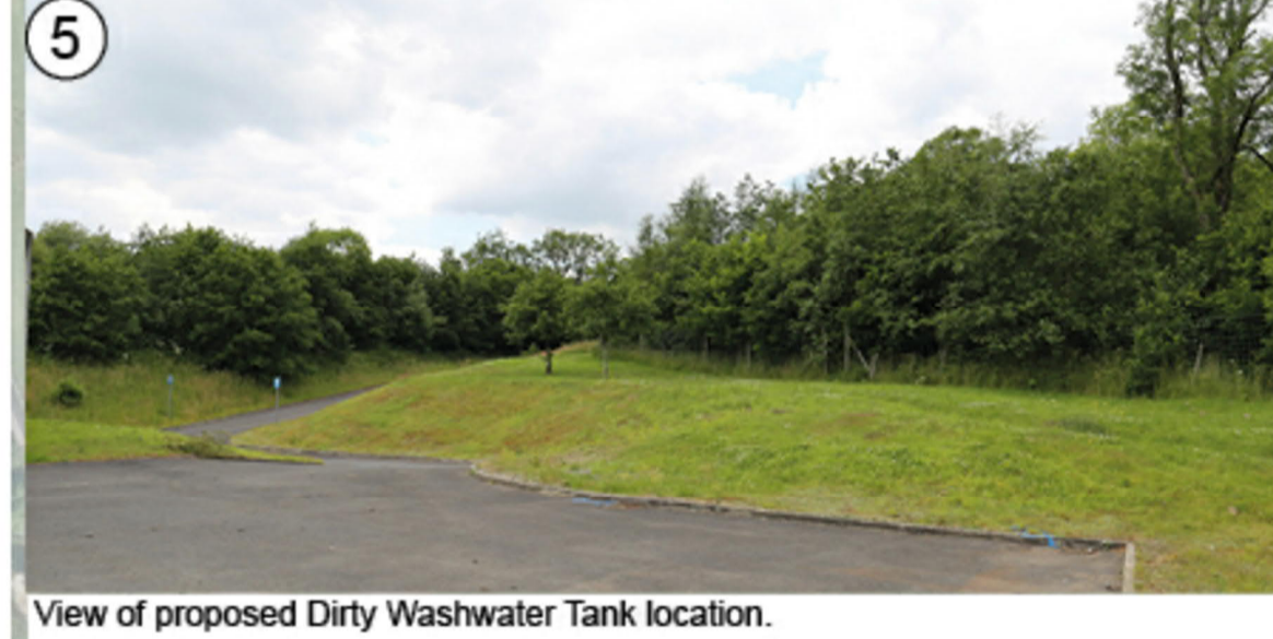
View of proposed Dirty Washwater Tank location.