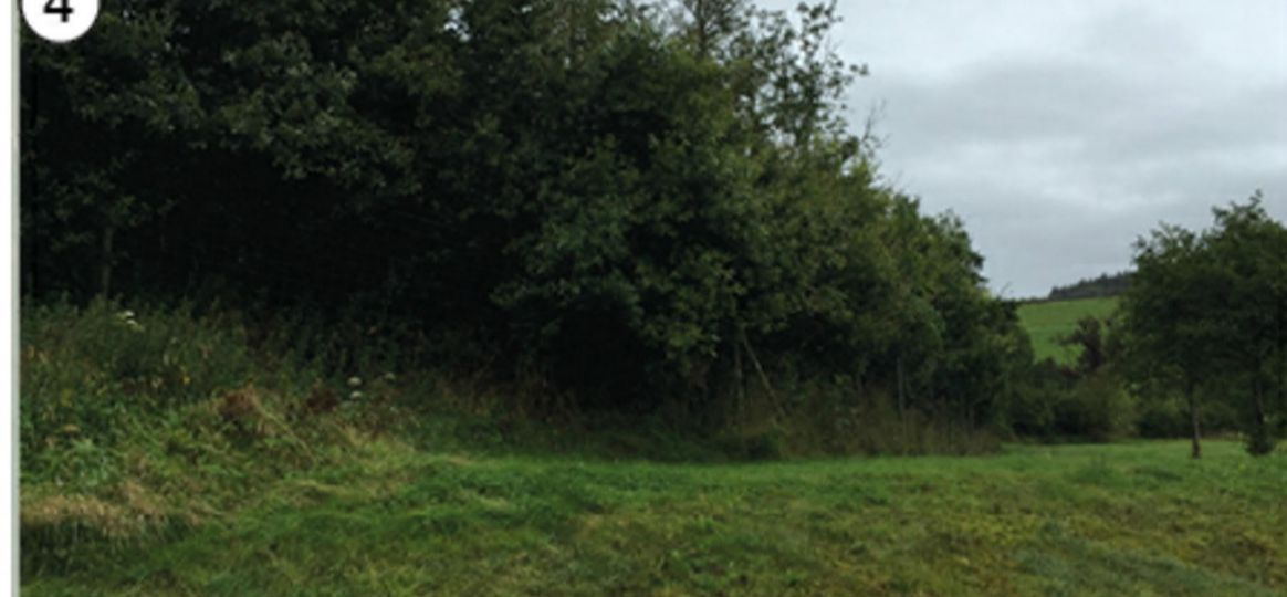
View looking at southern edge of the Dirty Wash Water Tanks site.