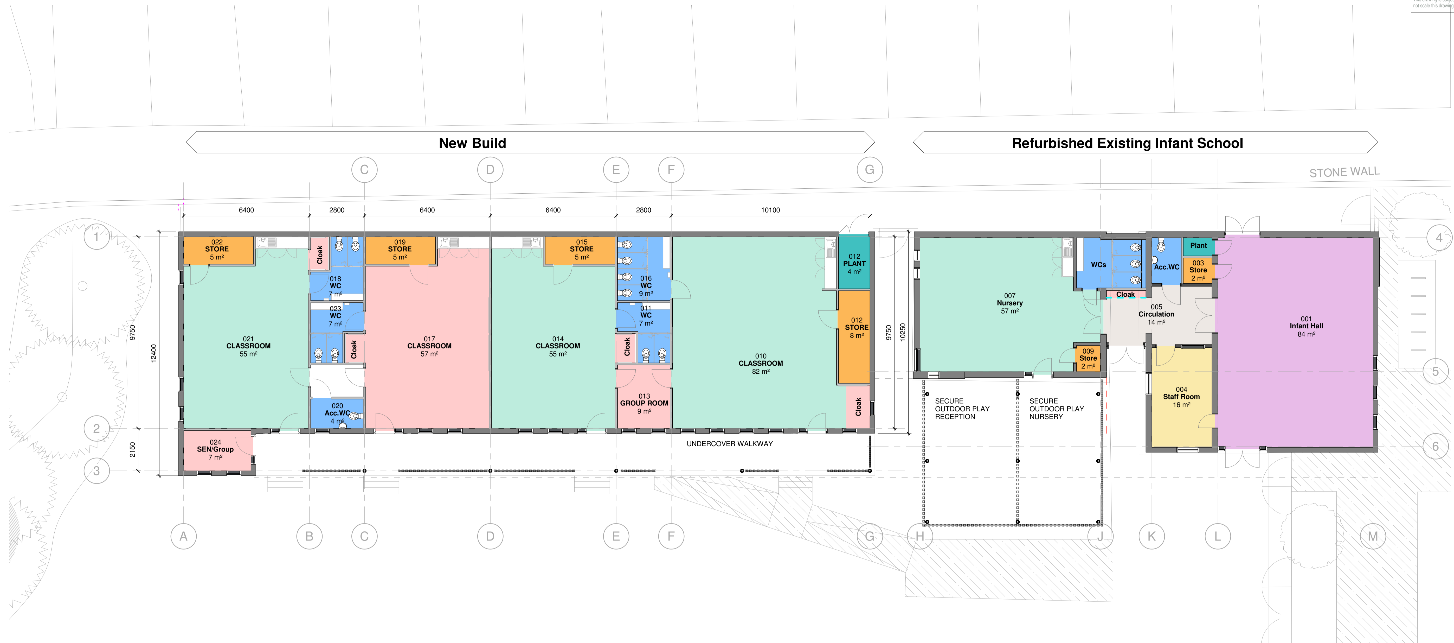
4 00-GROUND FLOOR - Site-Base Copy 1 1:100