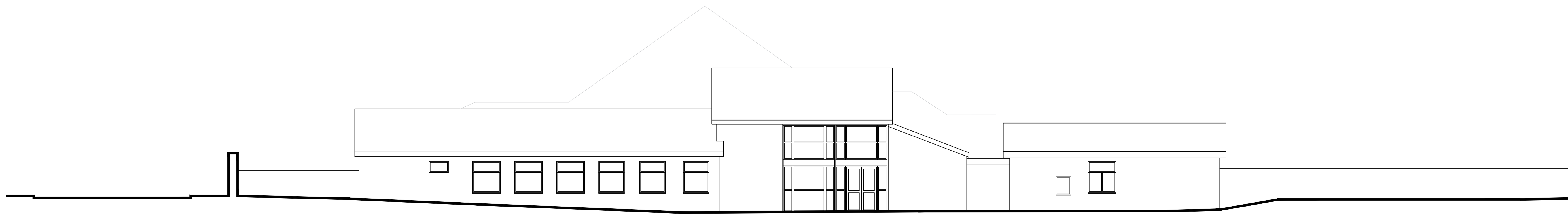
Right Elevation Scale 1:100