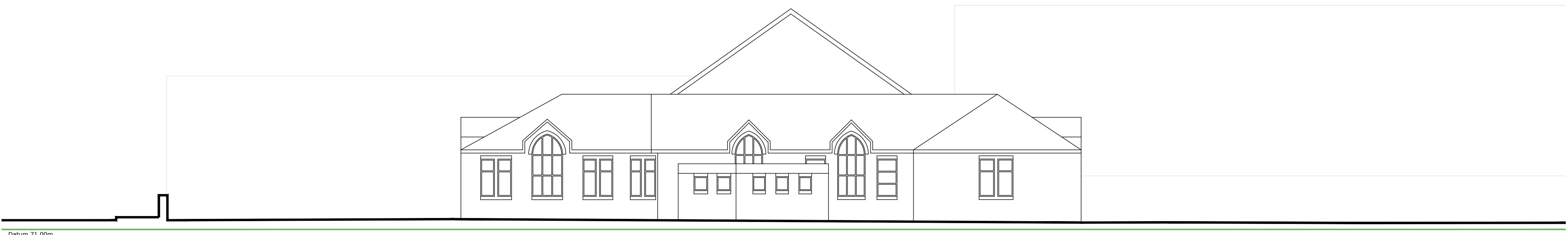
Right Elevation Scale 1:100