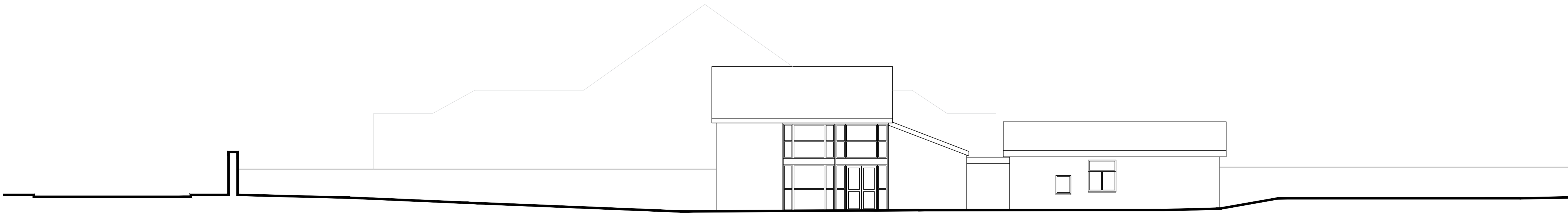
Right Elevation Scale 1:100