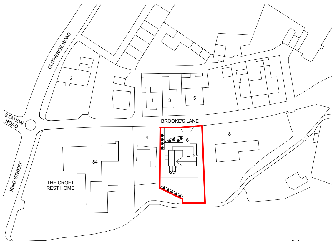
1 LOCATION PLAN 1 : 1250