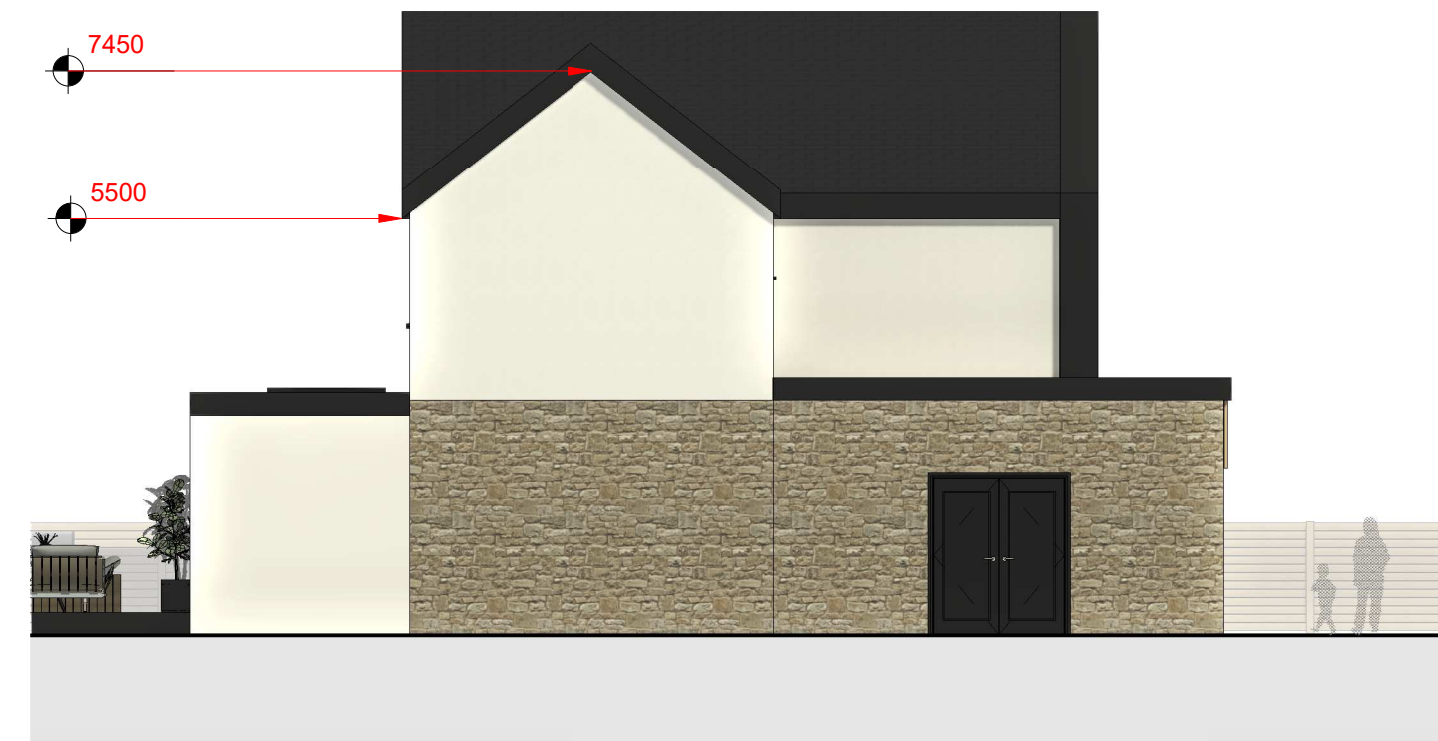
4 PROPOSED EAST 1 : 100