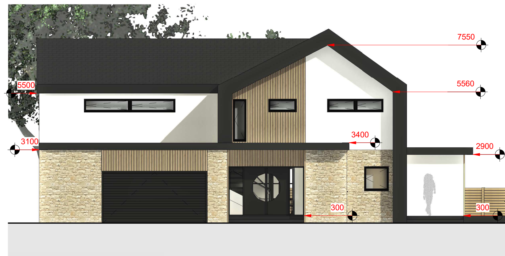
3 PROPOSED NORTH 1 : 100