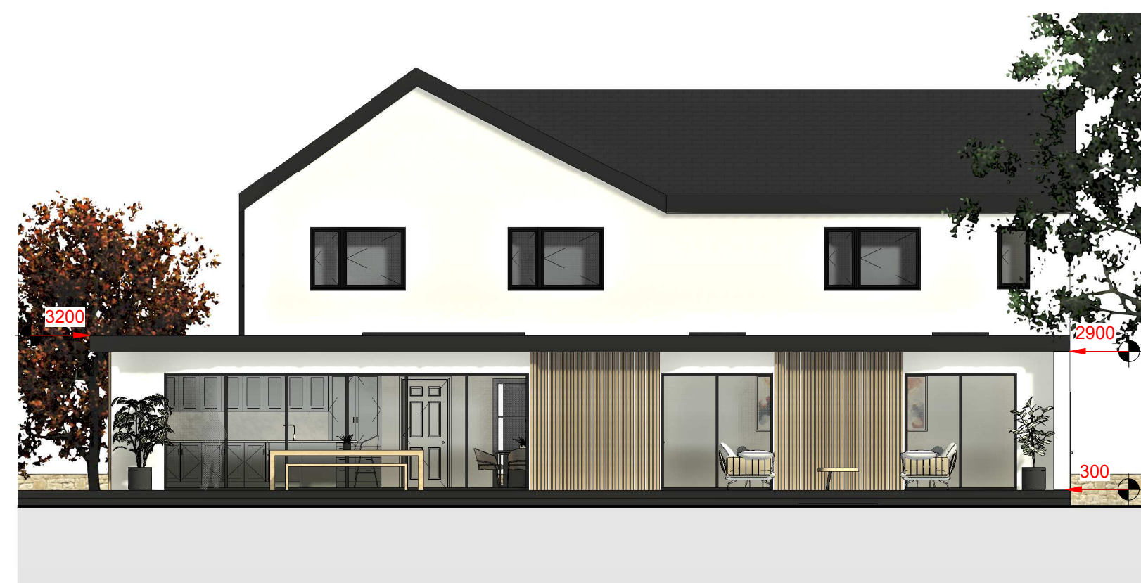
5 PROPOSED SOUTH 1 : 100