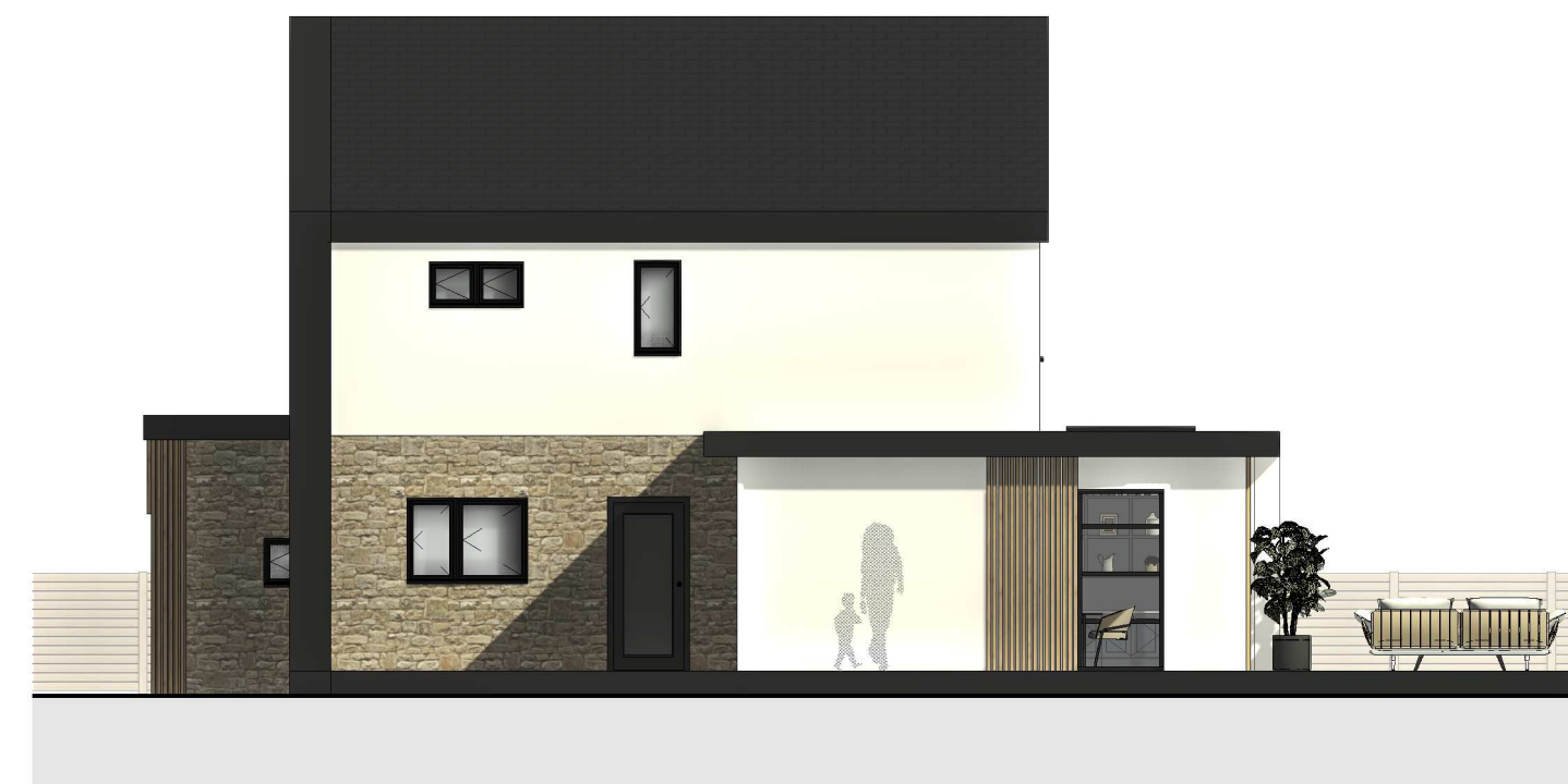
6 PROPOSED WEST 1 : 100