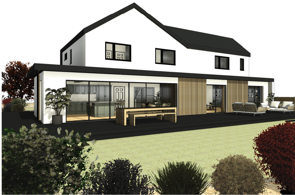
2 REAR EXTERNAL