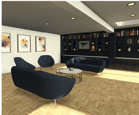
5 LIVING ROOM 3