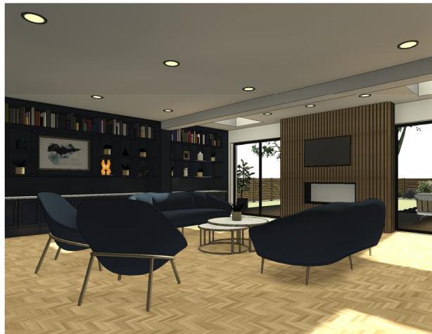
3 LIVING ROOM