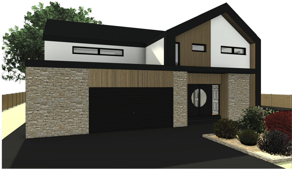
1 FRONT EXTERNAL