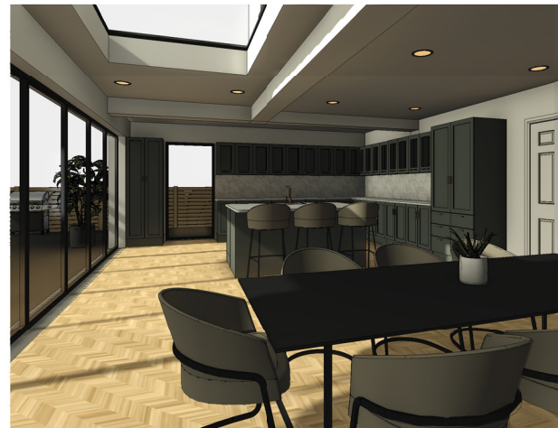
8 DINING / KITCHEN