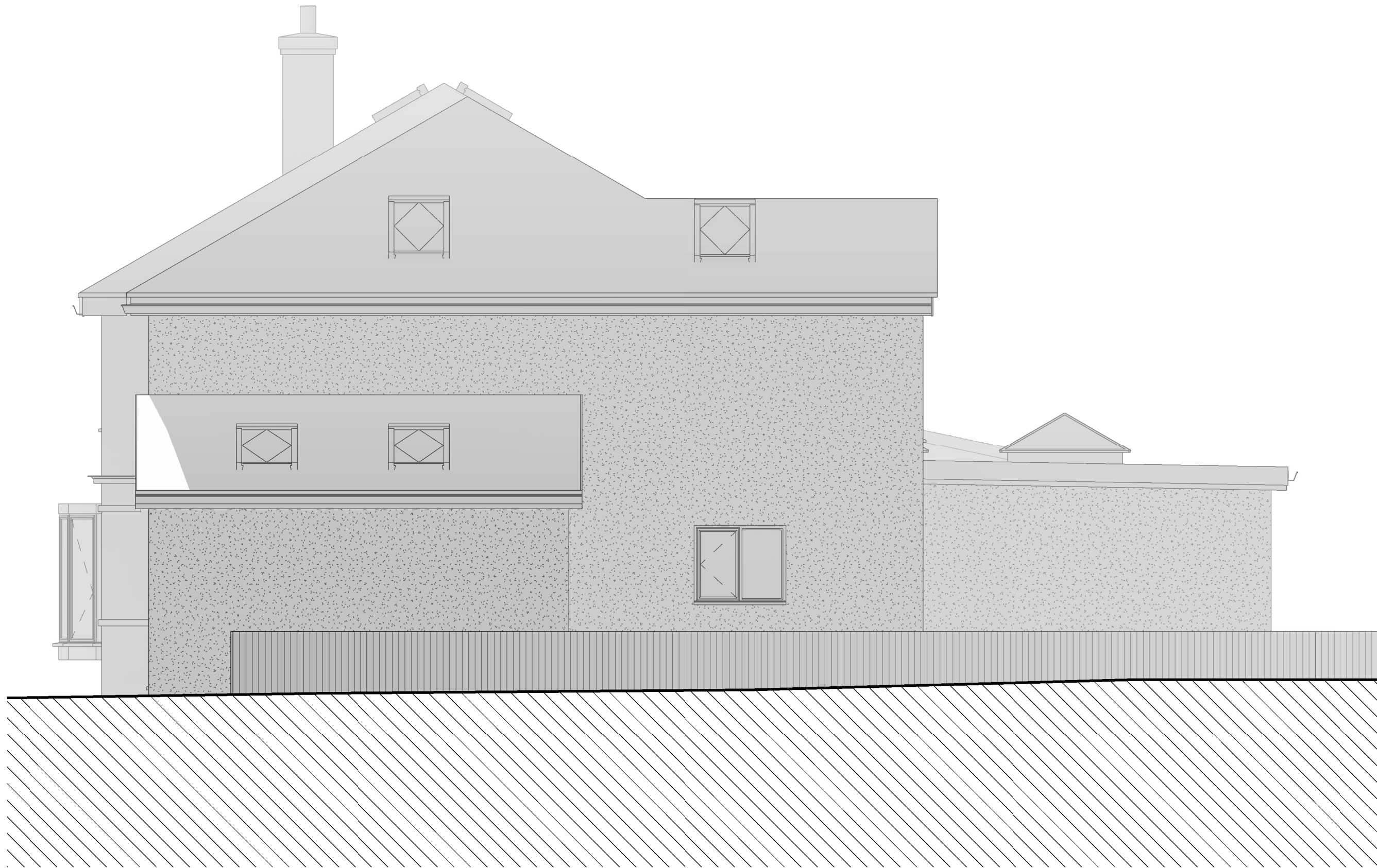
2 PROPOSED EAST 1 : 50