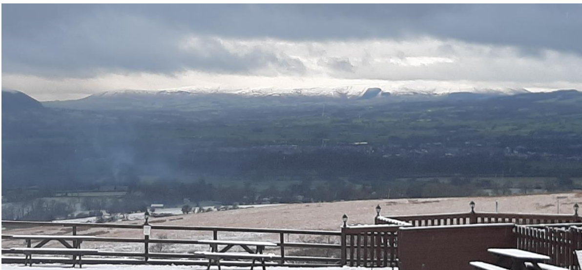
Sunsets and Winter views from the Wellsprings.