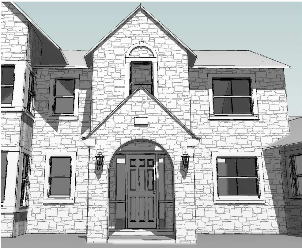
5 Front - Pitched