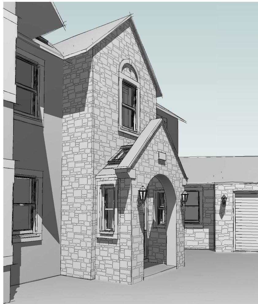
7 Side - Pitched