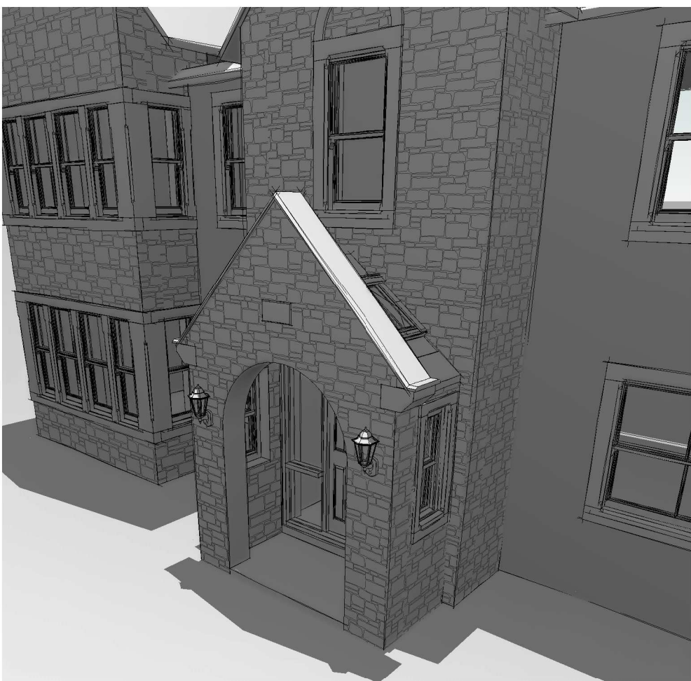
6 Top - Pitched