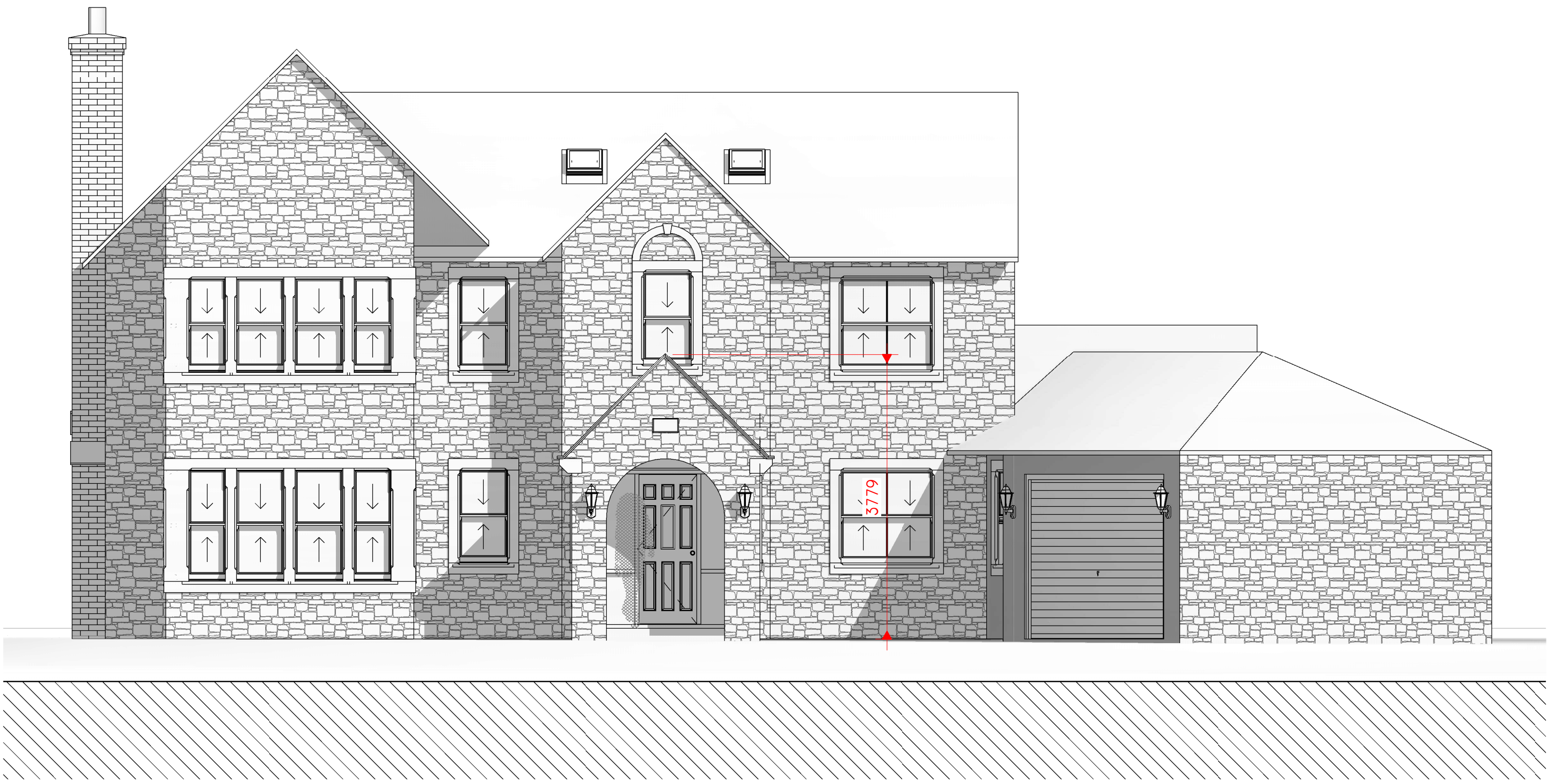
2 PROPOSED NORTH Pitched 1 : 50