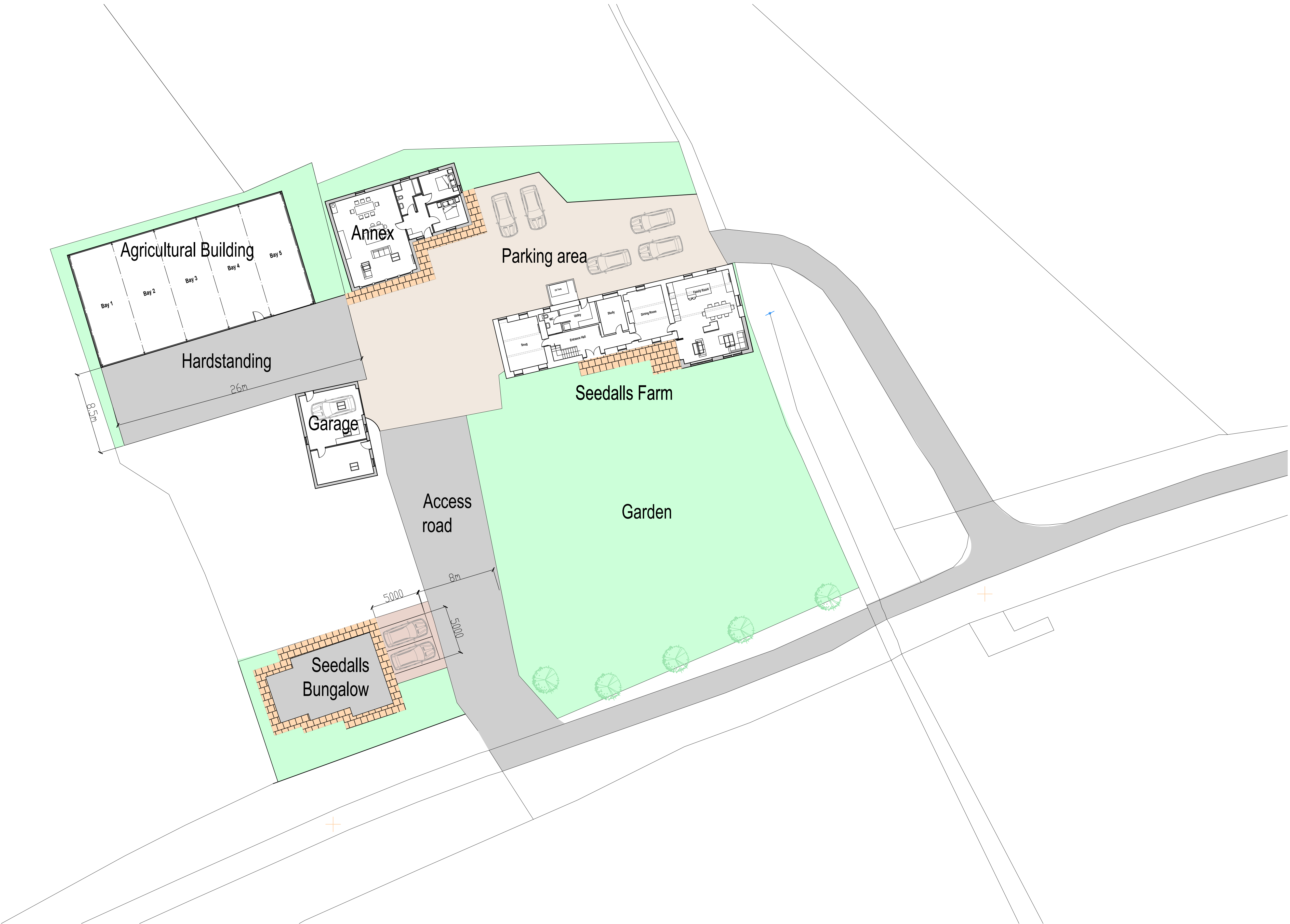
Proposed Site Layout 1:200 Scale