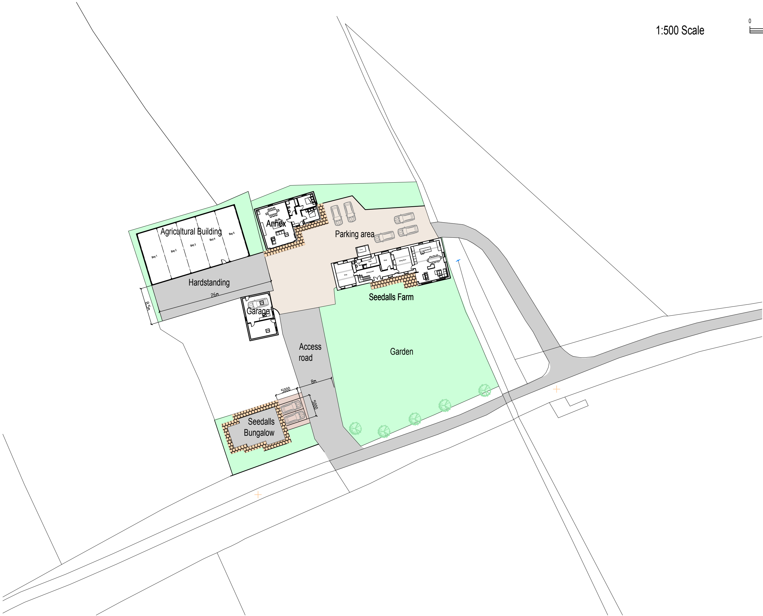
Proposed Site Layout 1:500 Scale