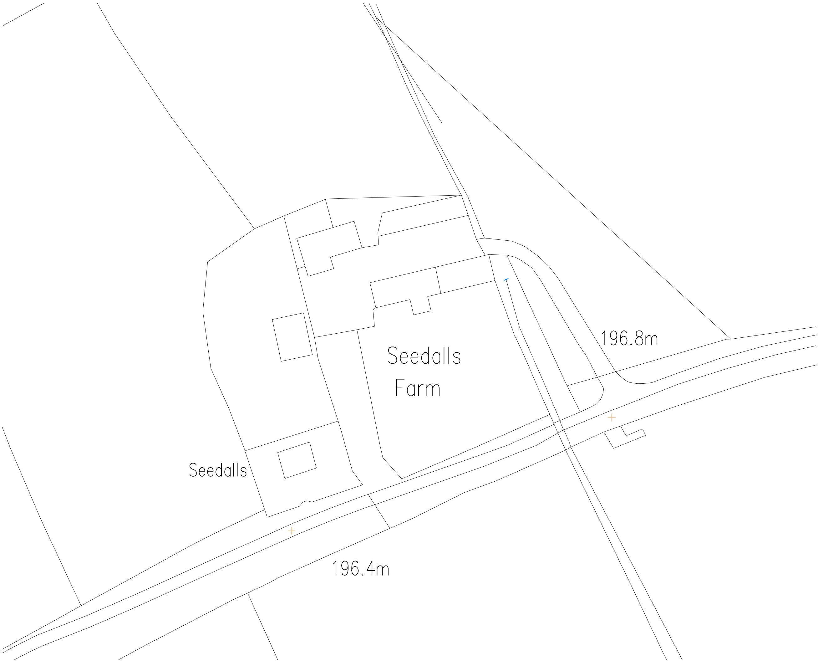
Existing Site Layout 1:500 Scale