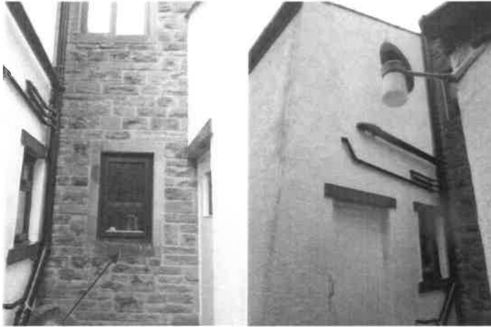
Lean to, to be extended to infill recess