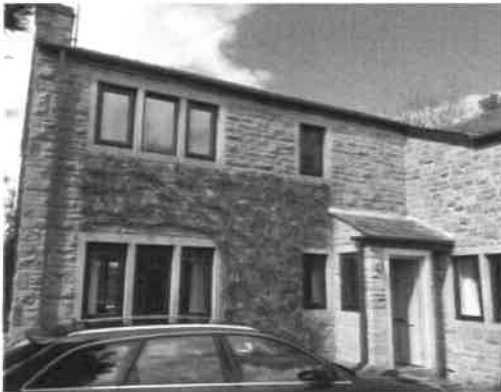
Front North east elevation

The property is a detached house with integrated garage and a conservatory to the rear, possibly dating from 1980's