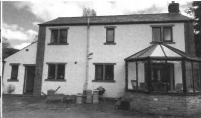
Rear South west elevation