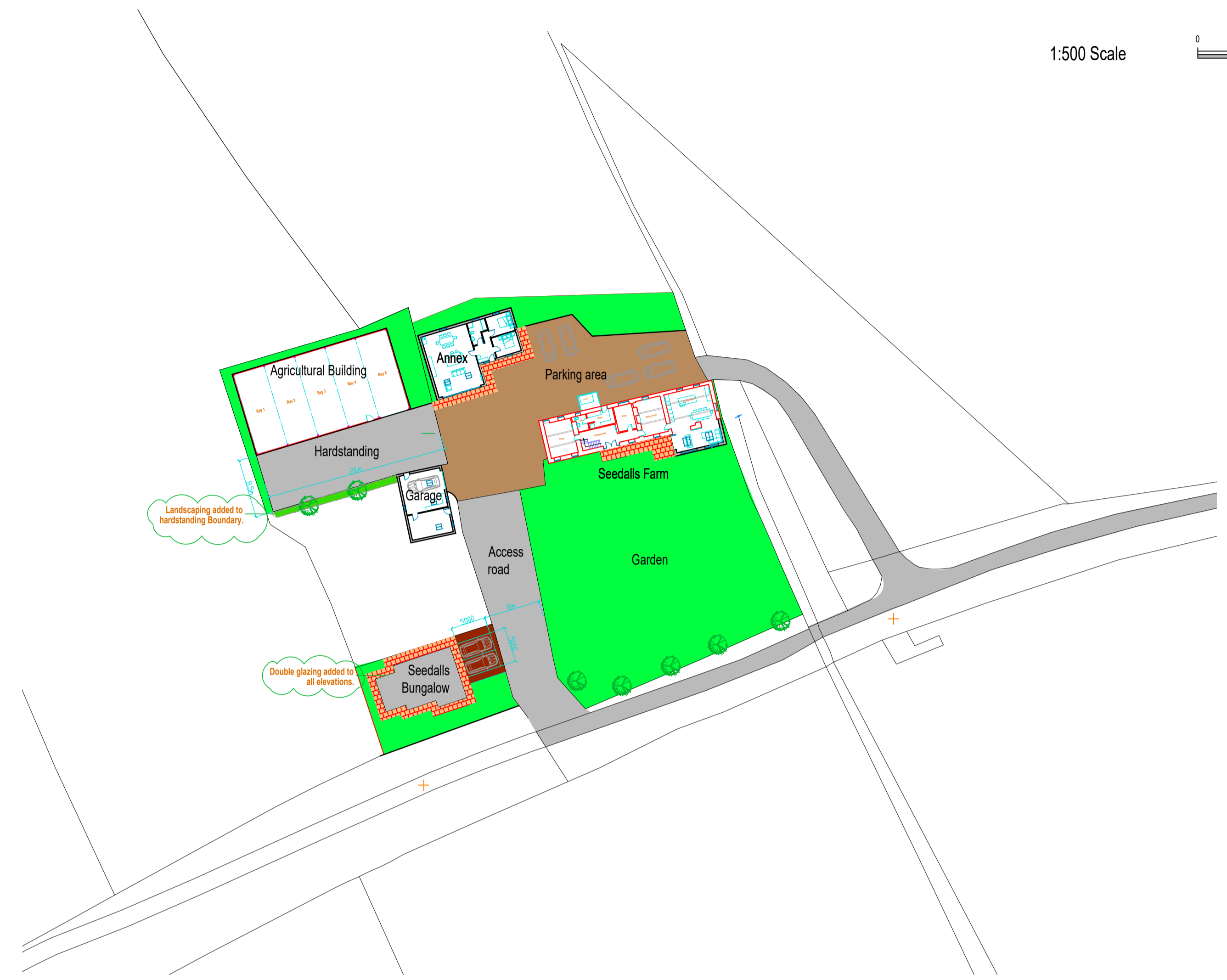
Proposed Site Layout 1:500 Scale

Rev A - Landscaping added to hardstanding southern boundary and bungalow to be double glazed. 16.11.21