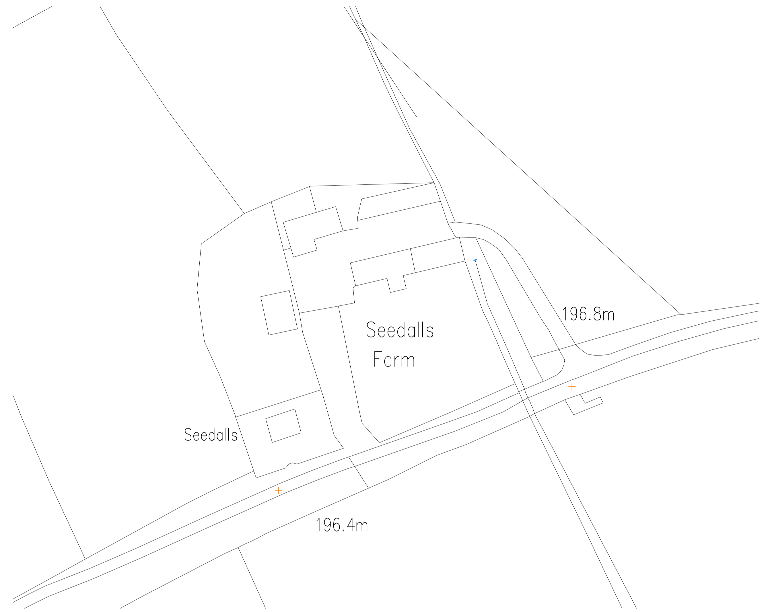
Existing Site Layout 1:500 Scale