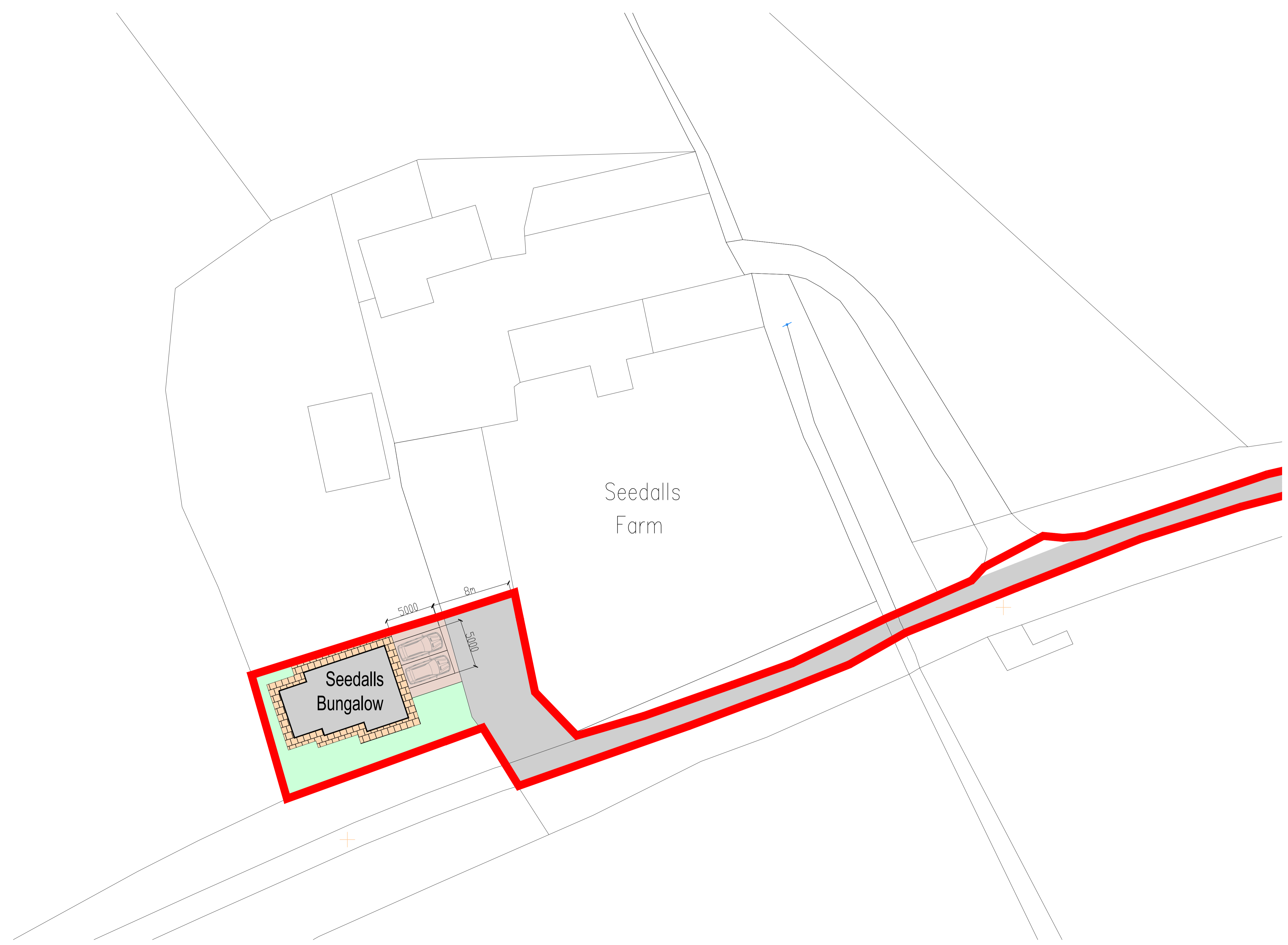
Proposed Site Layout 1:200 Scale