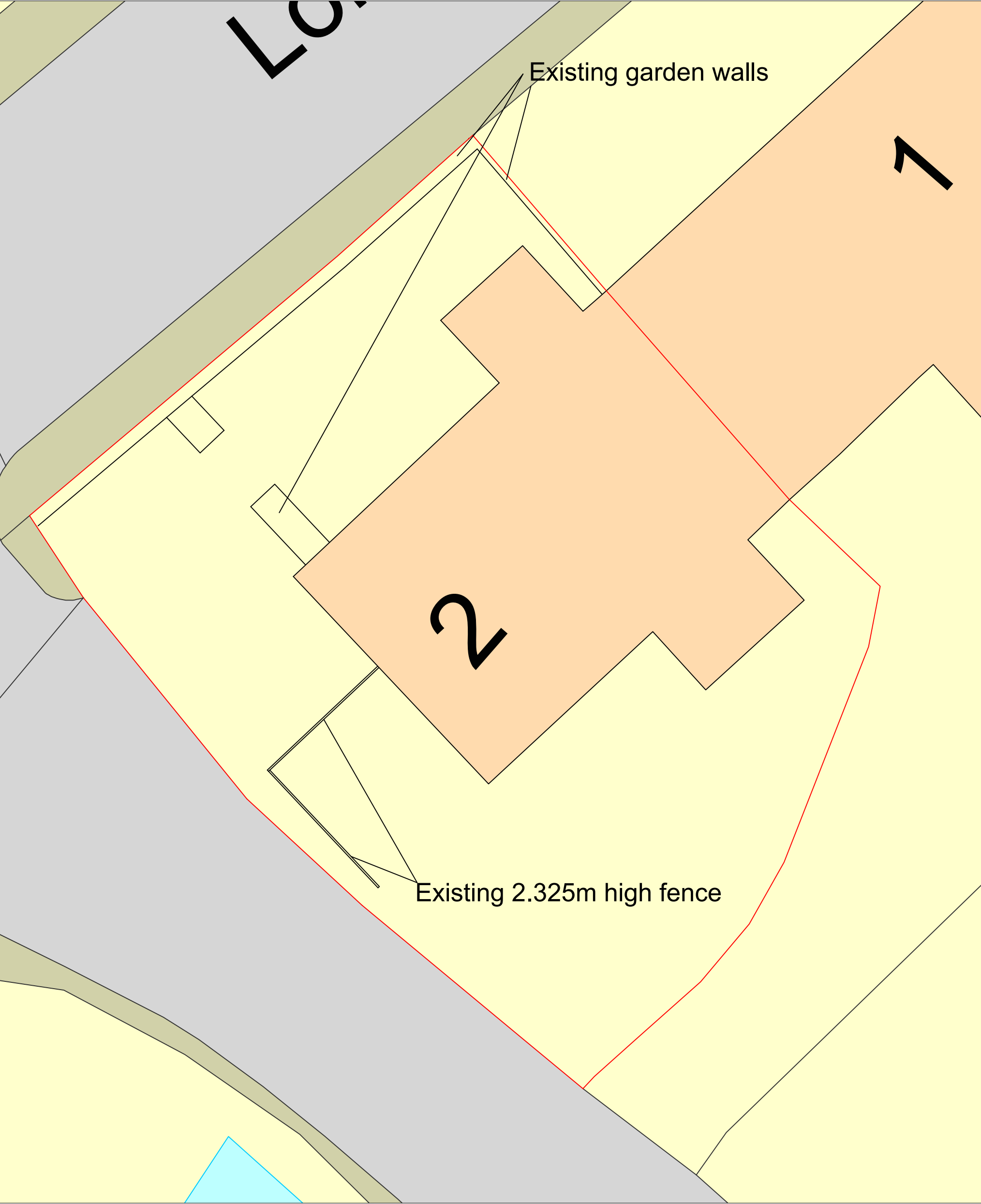
Existing Site Plan 1:100