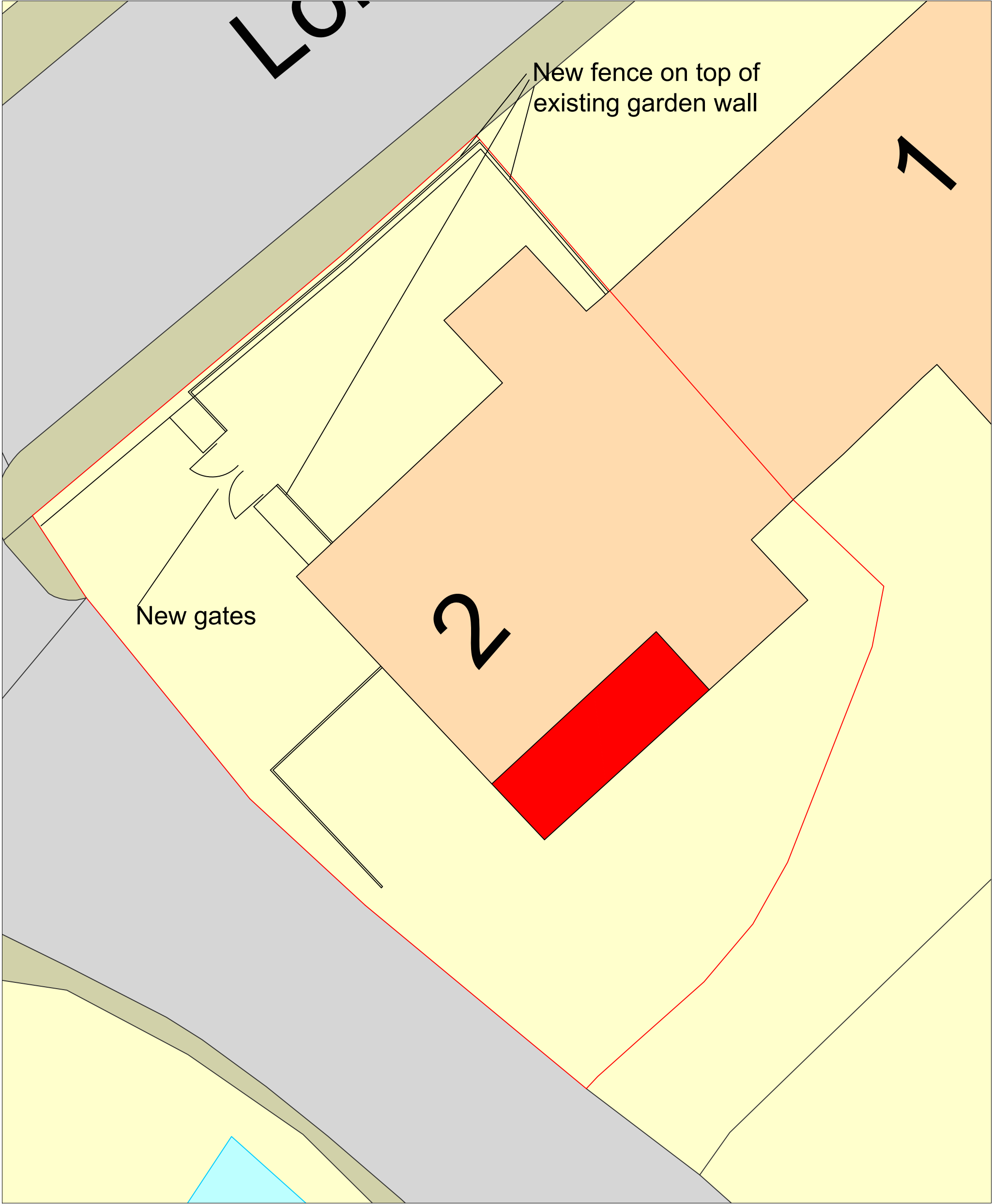
Proposed Site Plan 1:100