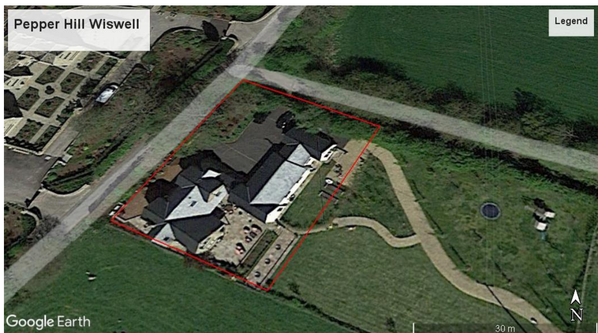
FIGURE 1. Site boundary indicated by the red line above.