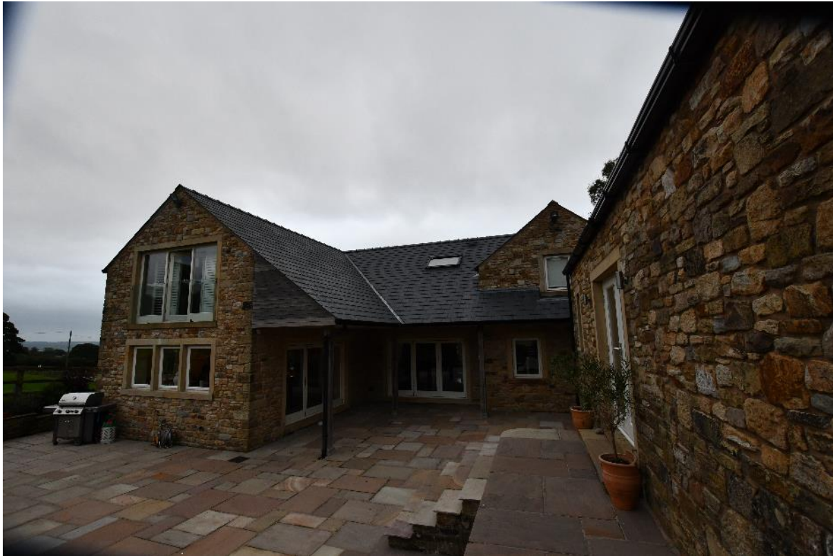
Image 1 Location of Proposed development area on target building