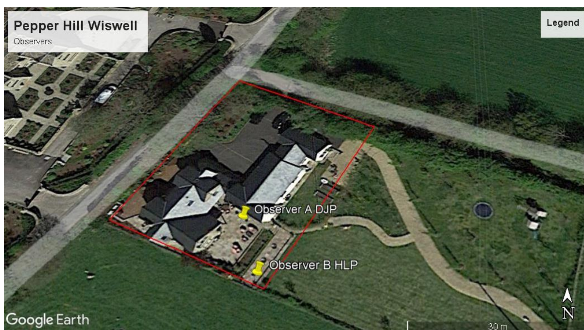
Figure 2 Observer Locations

No bats emerged from the target building despite extensive bat activity across site from foraging bats including noctules Nyctalus noctula , common pipistrelle Pipistrellus pipistrellus and soprano pipistrelle Pipistrellus pygmaeus .