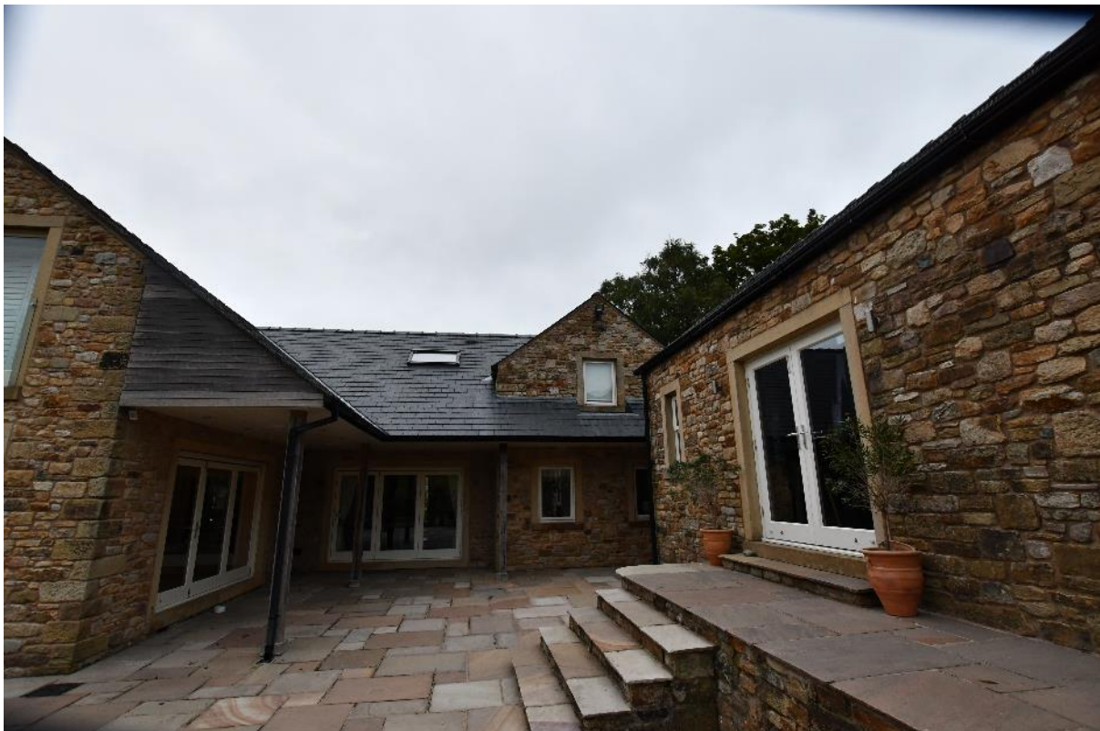
Image 2 Slight gap noted where the roof overhang meets the wall