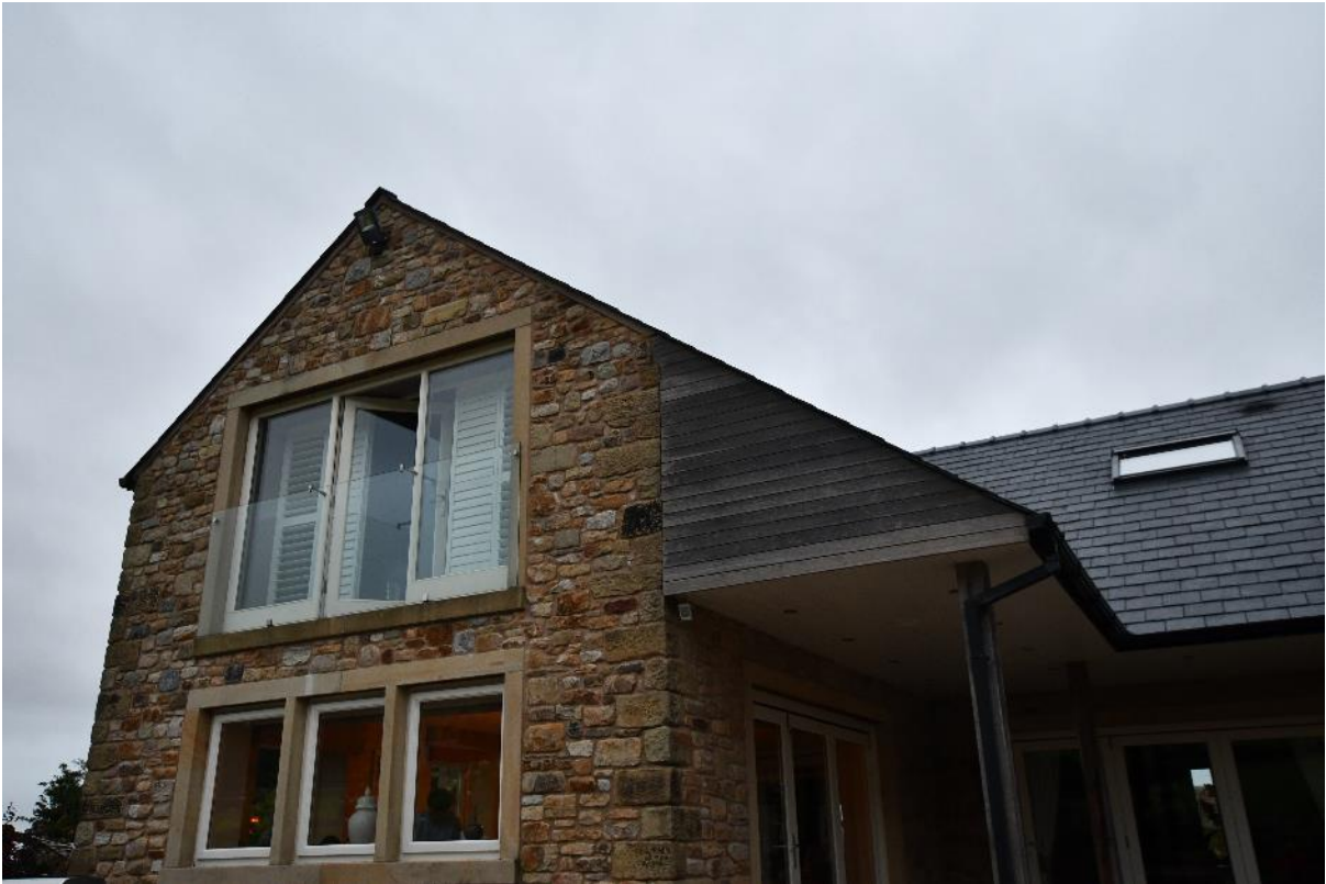
Image 3 Another view of wooden overhang with floodlights