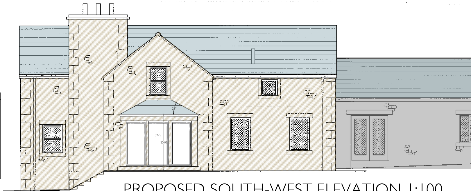
PROPOSED SOUTH-WEST ELEVATION 1:100