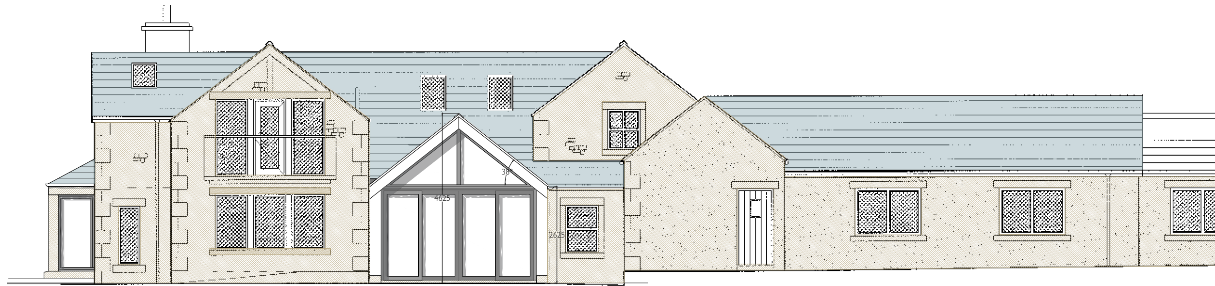
PROPOSED SOUTH-EAST ELEVATION 1:100