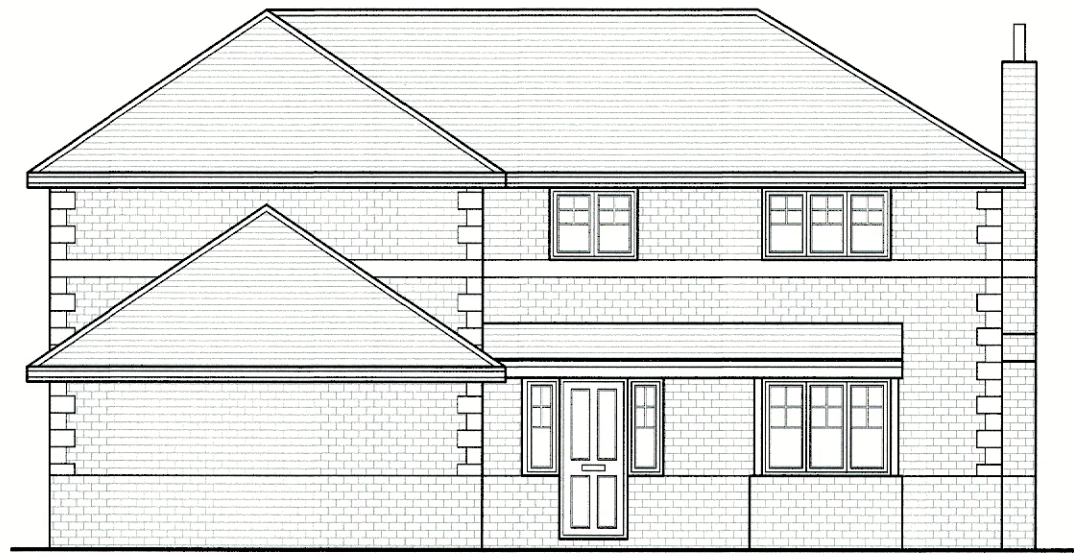
EXISTING SOUTH EAST FACING ELEVATION SCALE 1:100

This drawing is to be read in conjunction with all relevant Architect, consultants' and specialists' drawings and specifications. The Architect is to be notified of any discrepancies before proceeding. Do not scale from this drawing. All dimensions and levels are to be checked on site. This drawing is subject to copyright. All work carried out before Planning and Building Permission has been granted is at the contractor's risk. Note: Proposed drawing based on OS dwg information. All illustrated dimensions are approximate and all site dimensions are to be checked on site and subject to site survey.