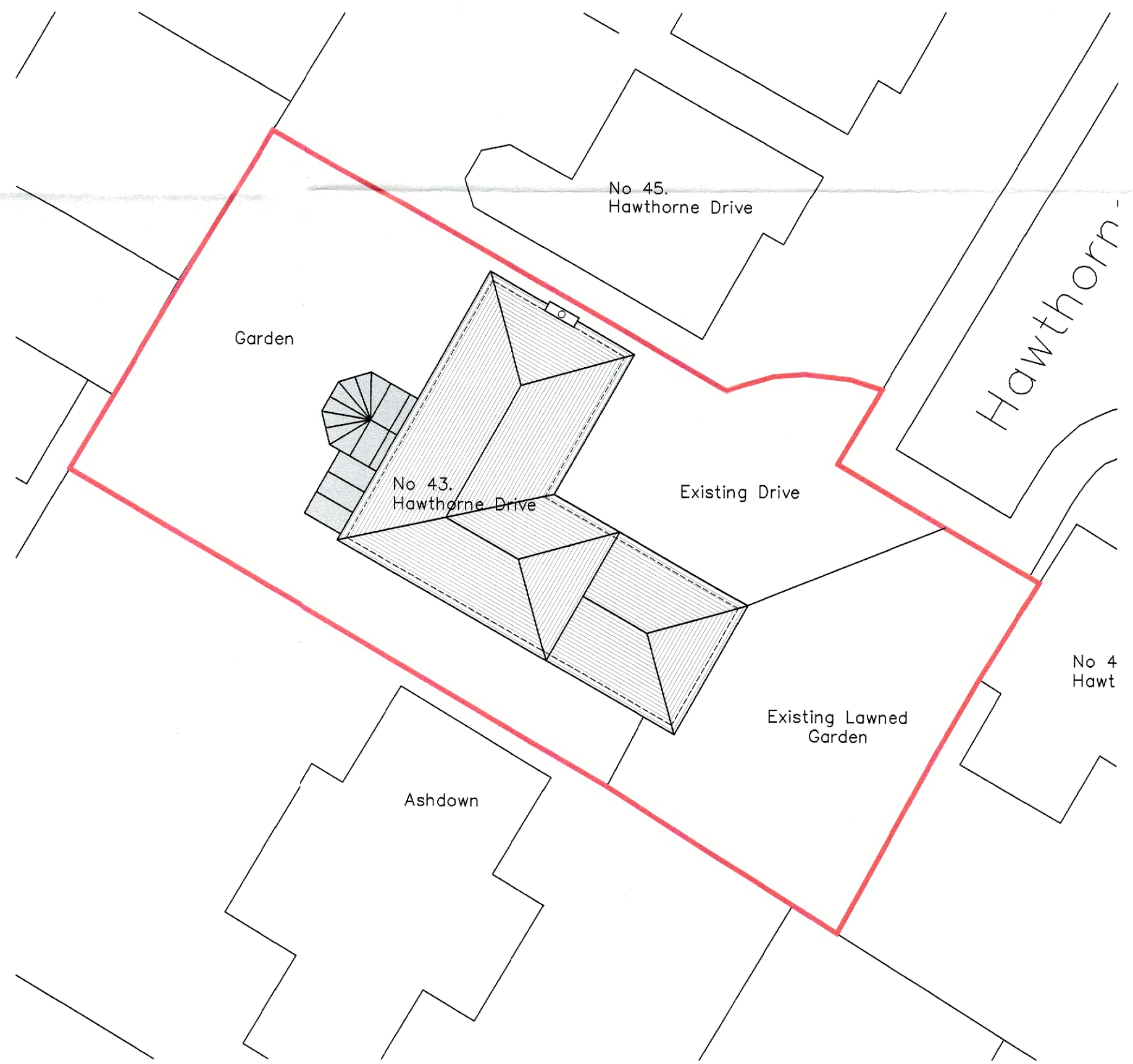
EXISTING SITE PLAN SCALE 1:200