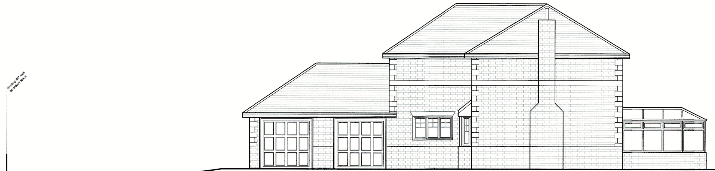
EXISTING NORTH EAST FACING ELEVATION SCALE 1:100