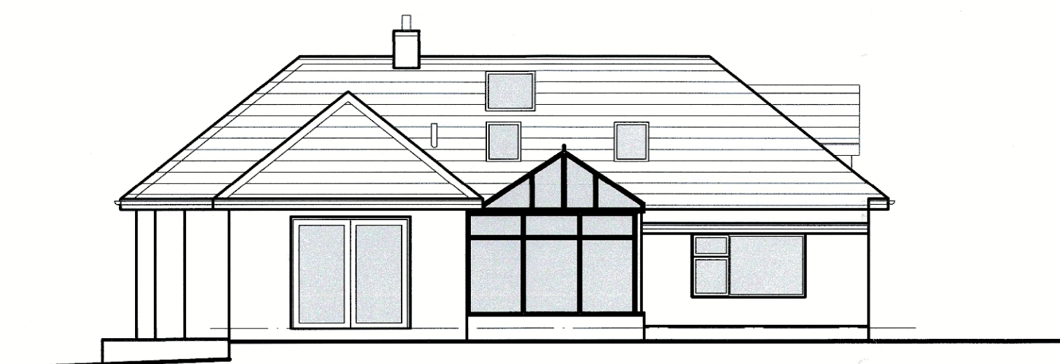
South East Elevation 1:100 Scale