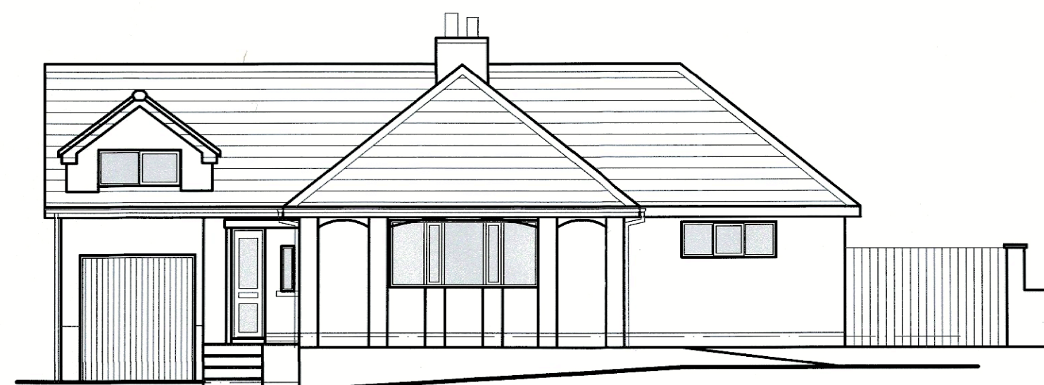
South West Elevation 1:100 Scale