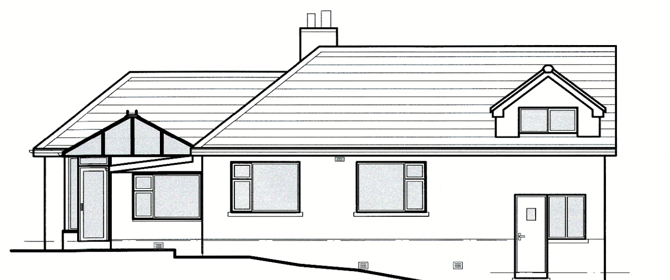
North East Elevation 1:100 Scale