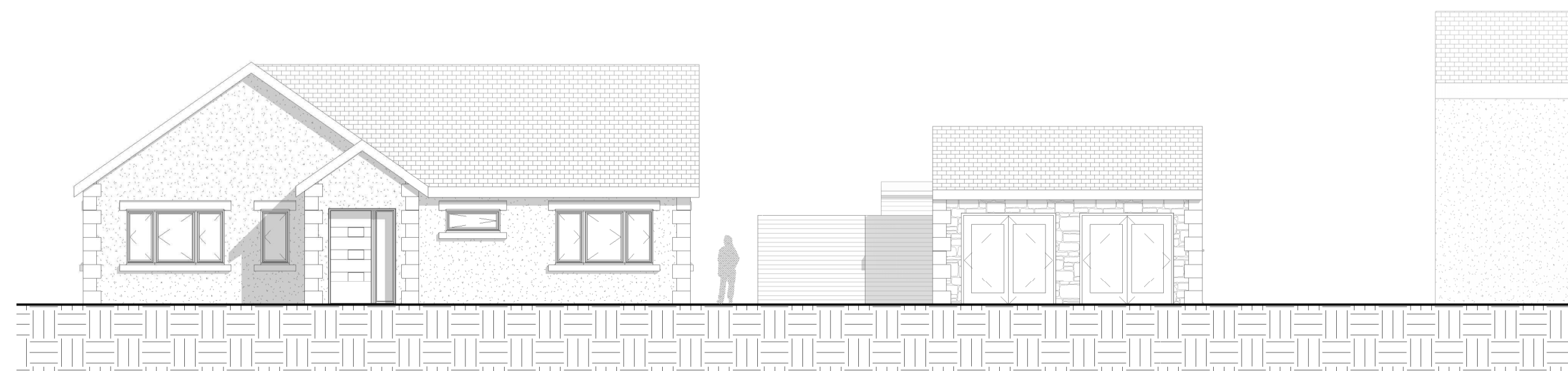
4 PROPOSED SOUTH 1 : 100