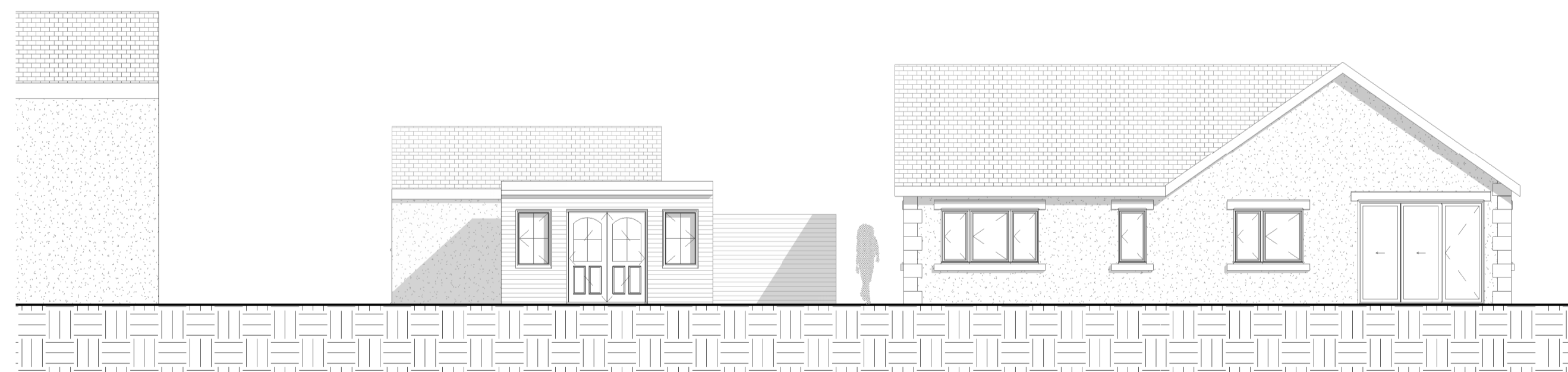
2 PROPOSED NORTH 1 : 100