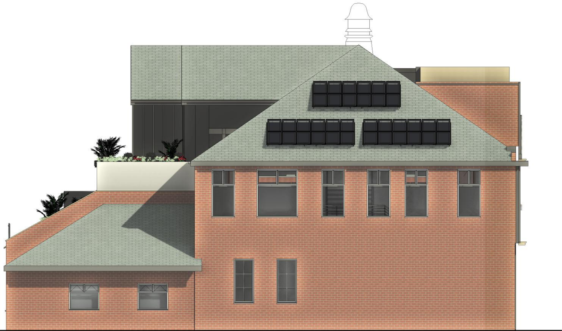
3 Proposed East 1 : 100