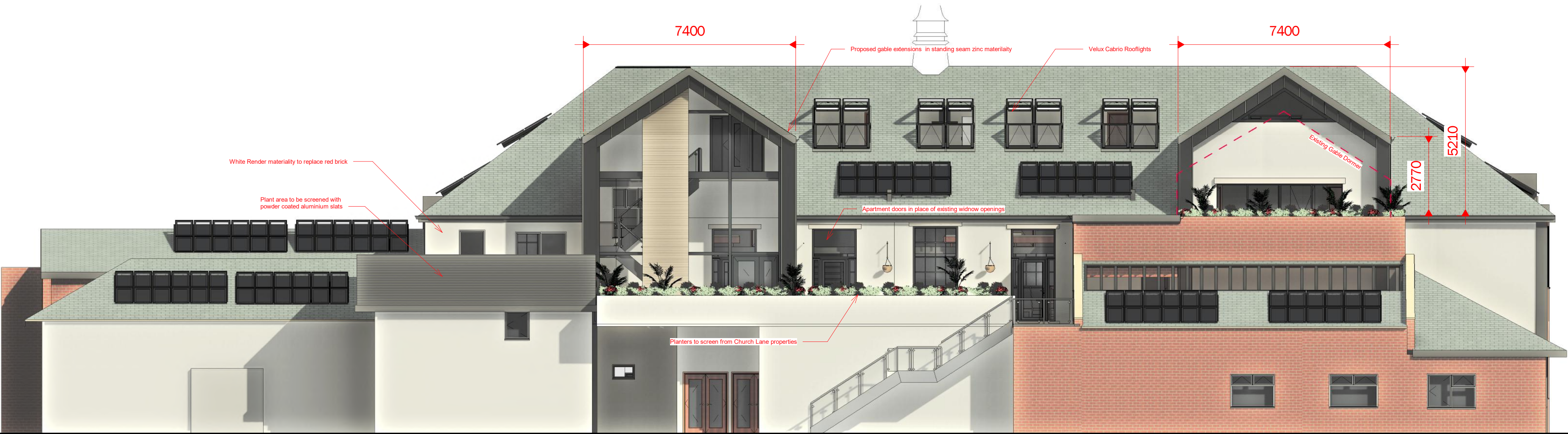
2 Proposed South 1 : 100