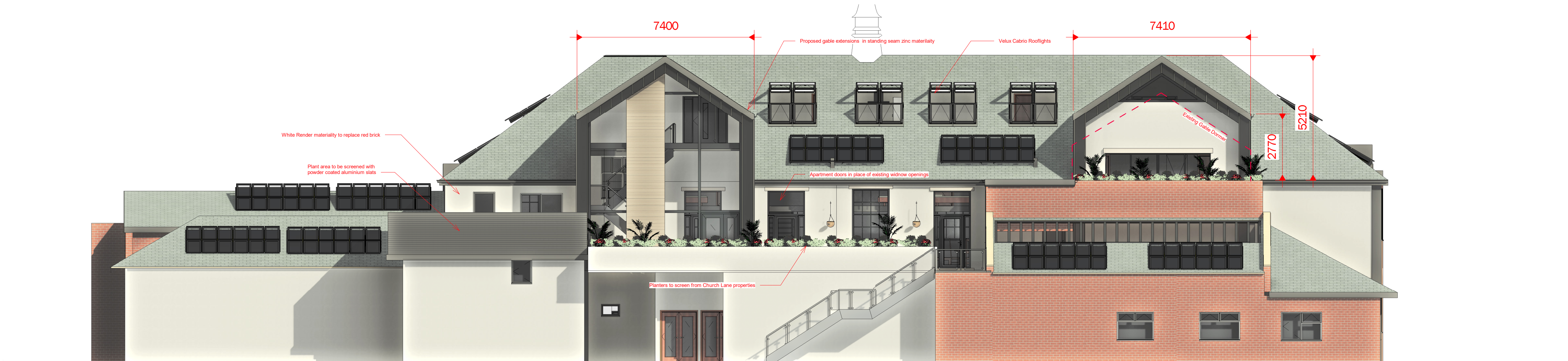
2 Proposed South 1 : 100