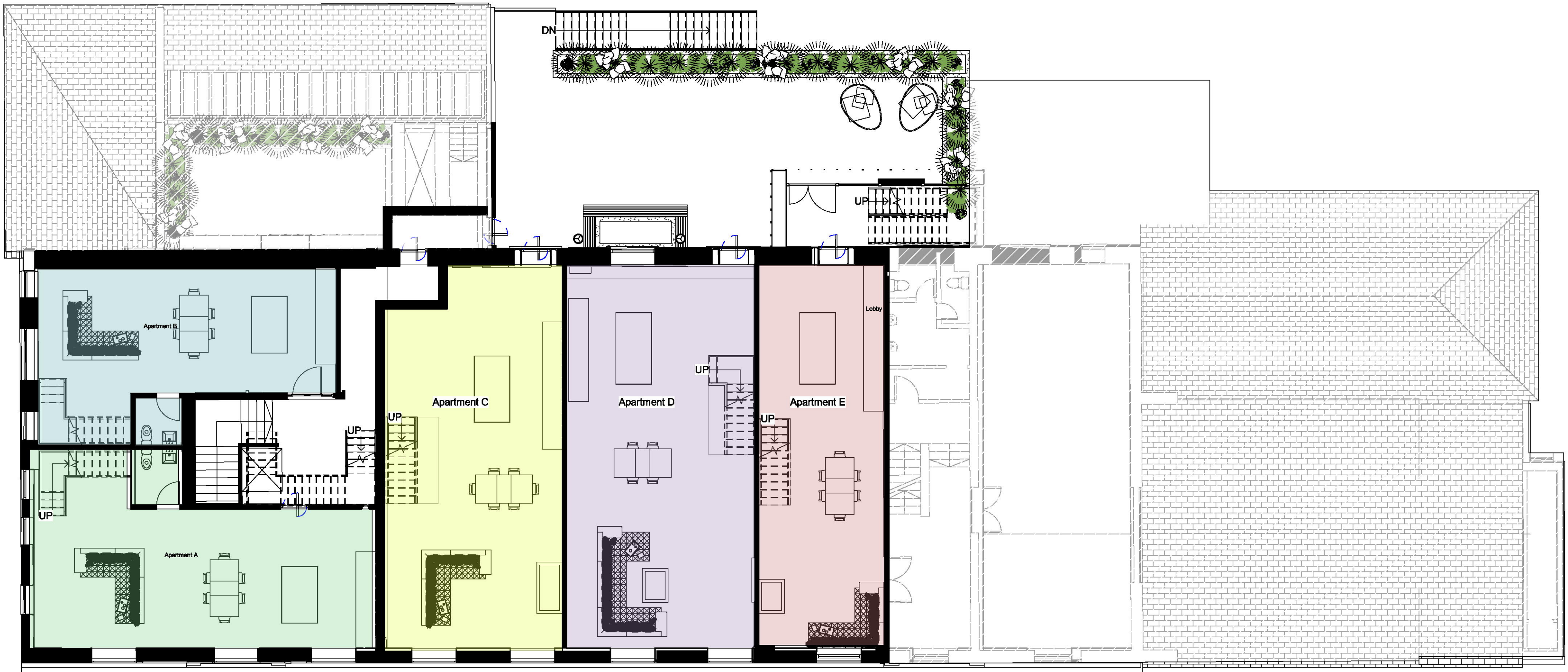
1 PROPOSED FIRST FLOOR