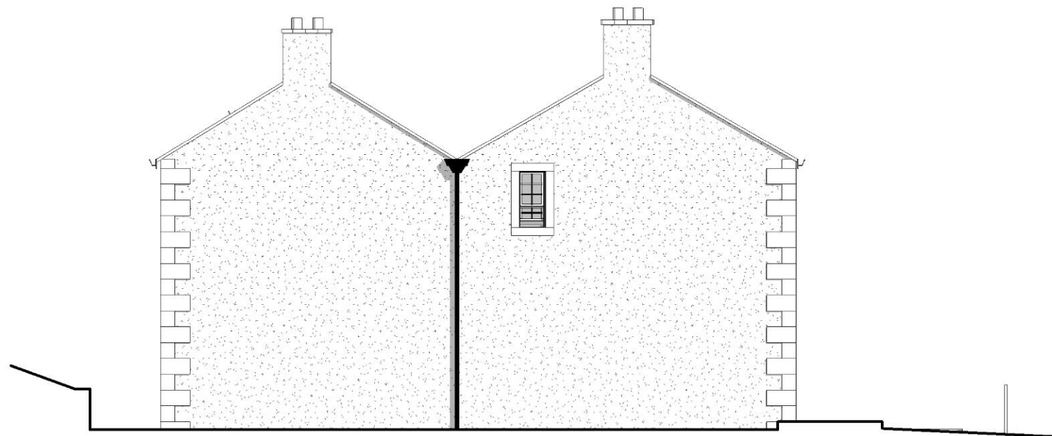
EXISTING SOUTH WEST