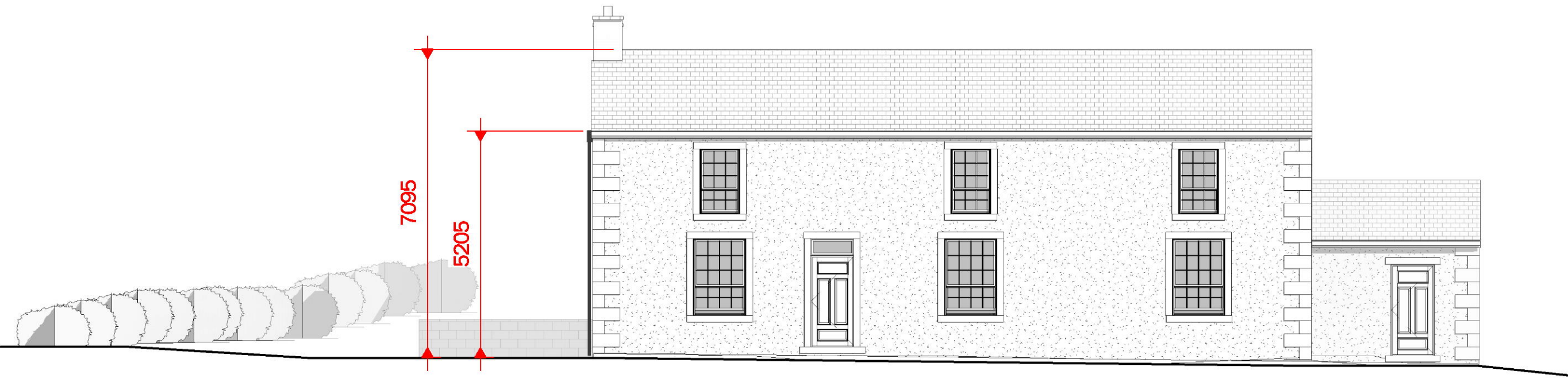
EXISTING SOUTH EAST