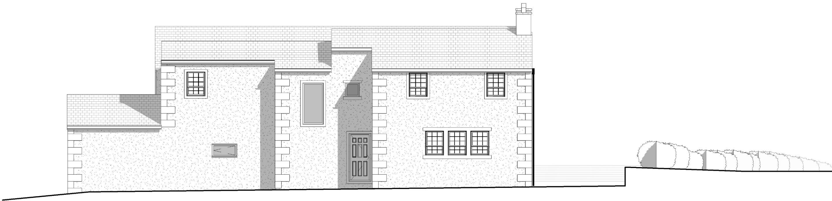
EXISTING NORTH WEST