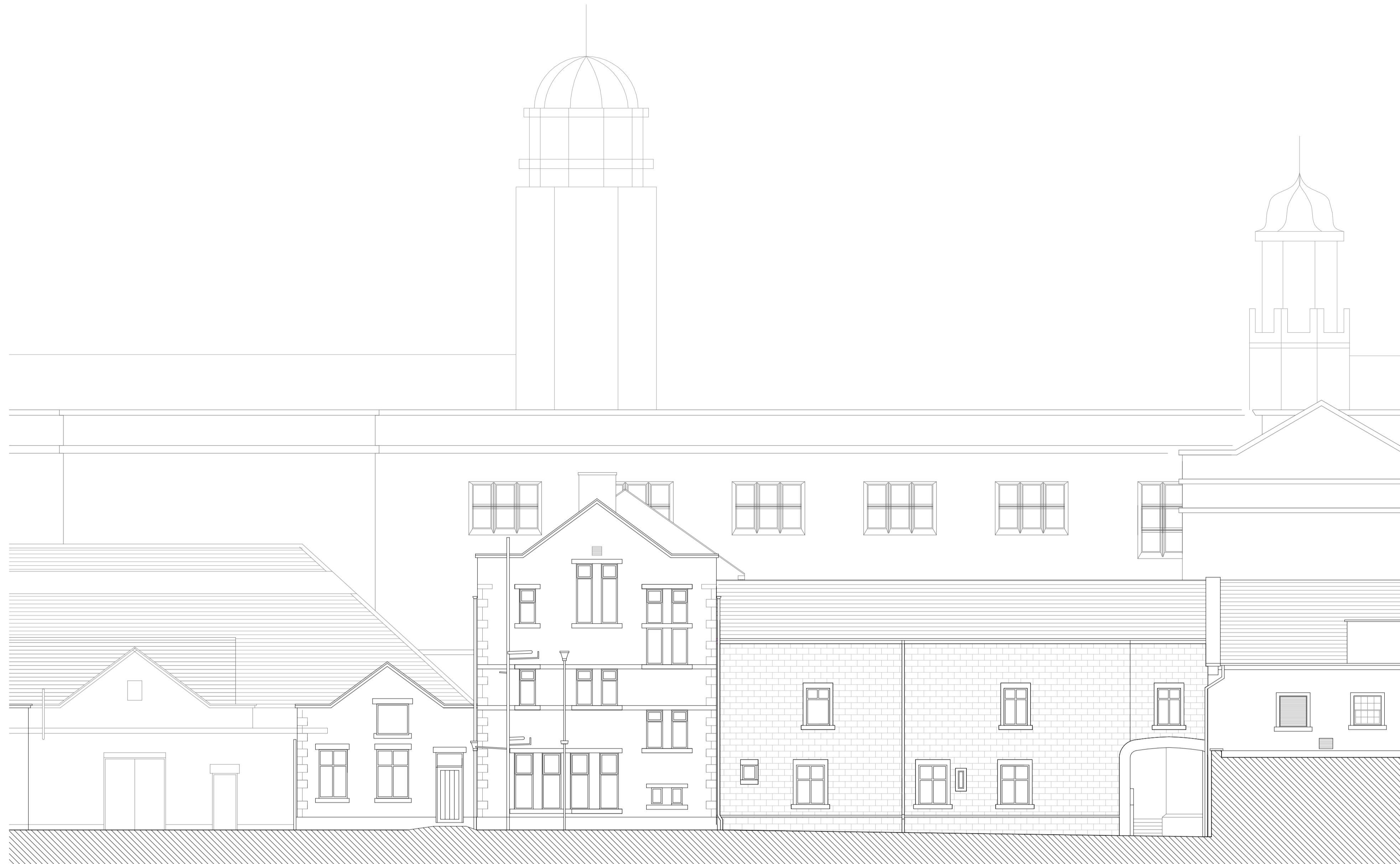
1 North Elevation - Existing