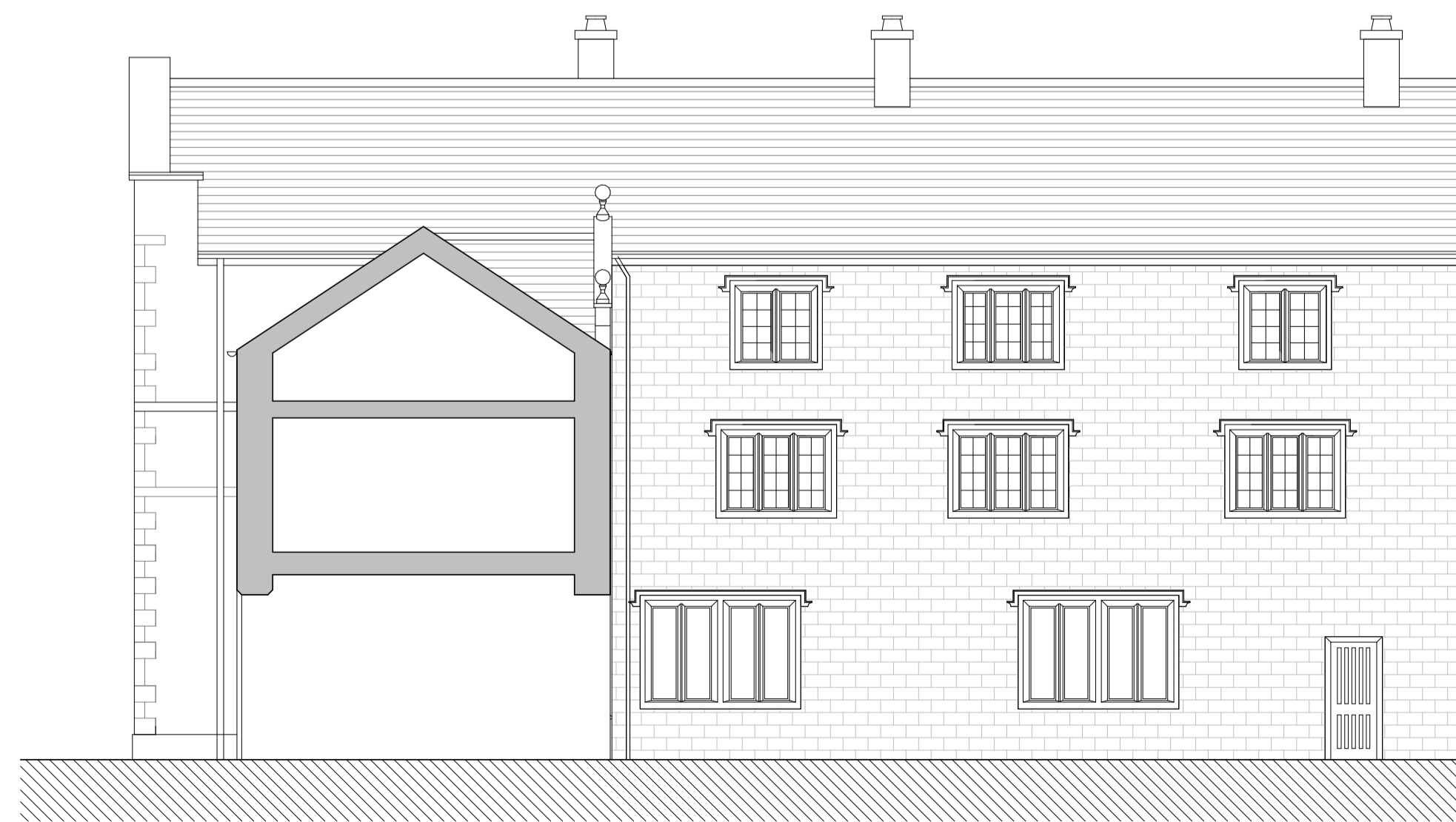
2 West Elevation - Existing