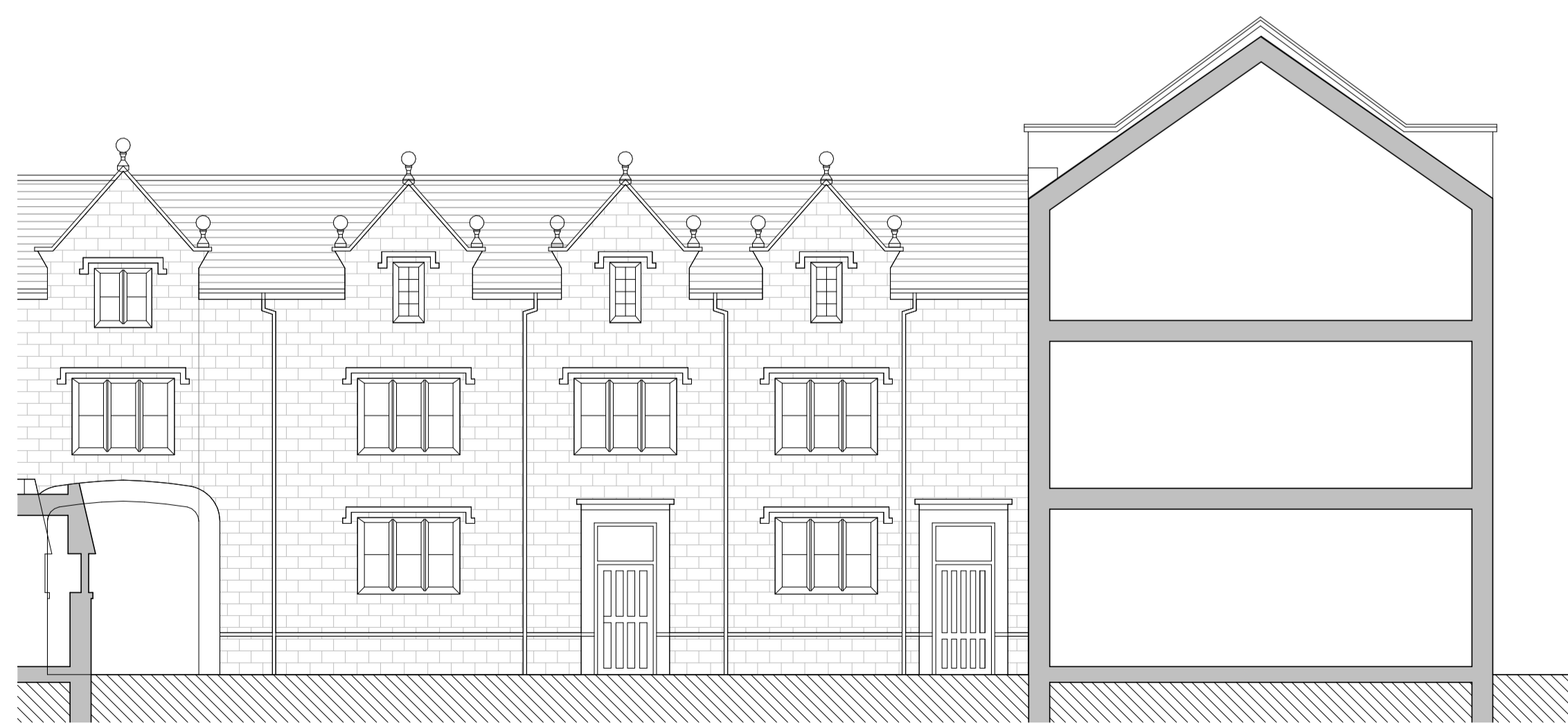
3 South elevation - Existing