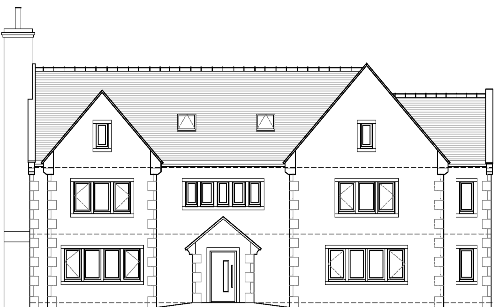
PROPOSED SOUTH ELEVATION Scale 1:100