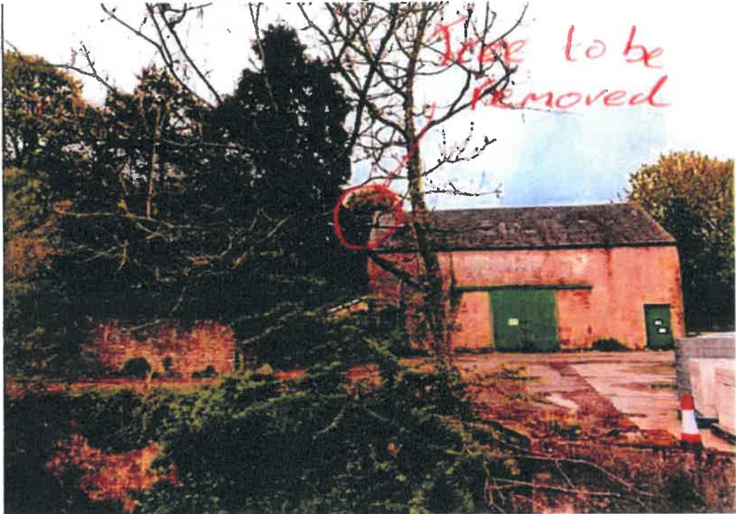
Position 3 = From the view of Grove Row cottages