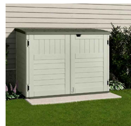
LOCKABLE WHITE PLASTIC EUROBIN STORAGE UNIT, WITH OPENABLE LID FOR BIN USE, AND DOUBLE LOCKABLE DOORS FOR EASY ACCESS/EGRESS