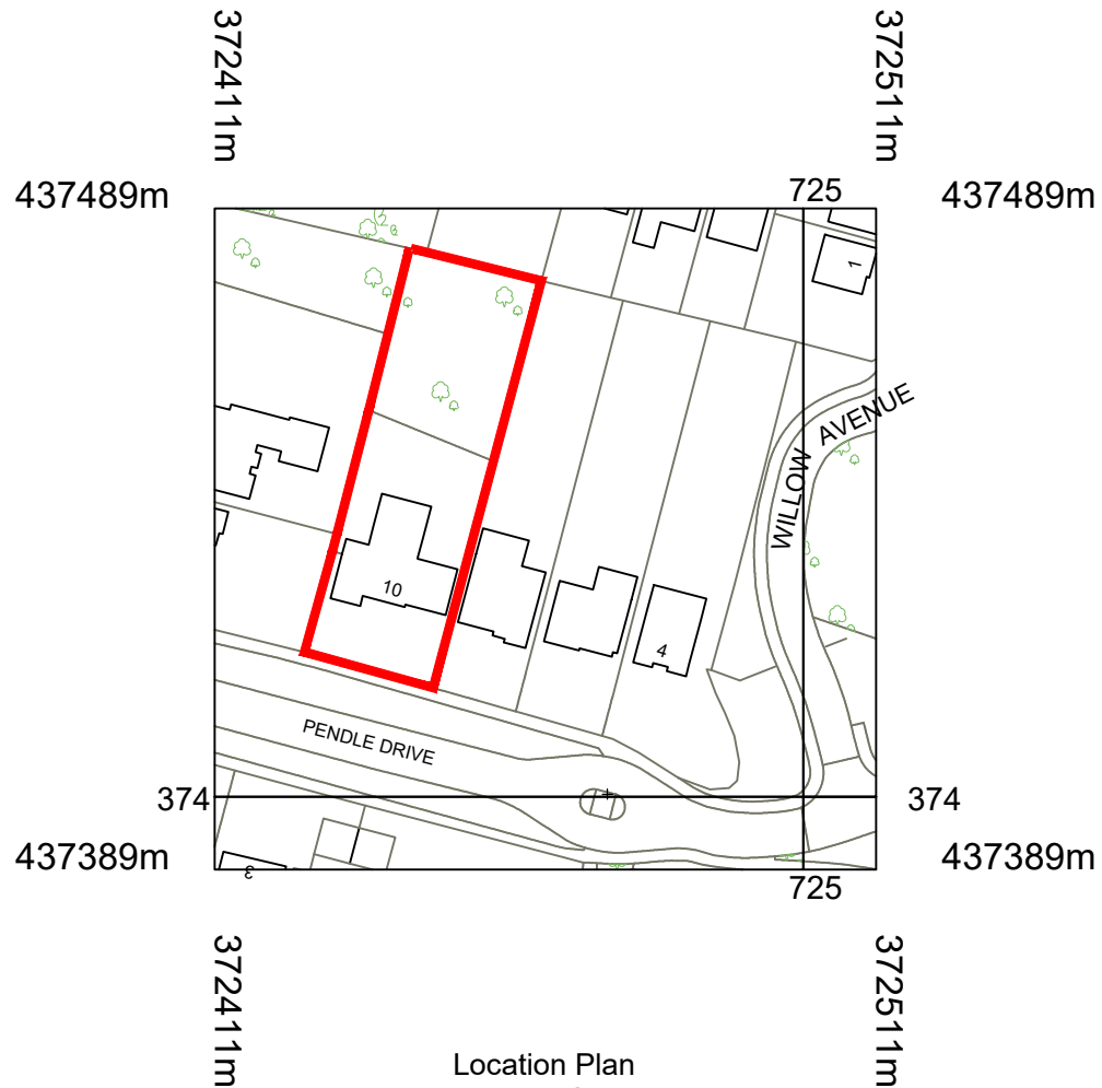
Location Plan 1 : 1250 Scale