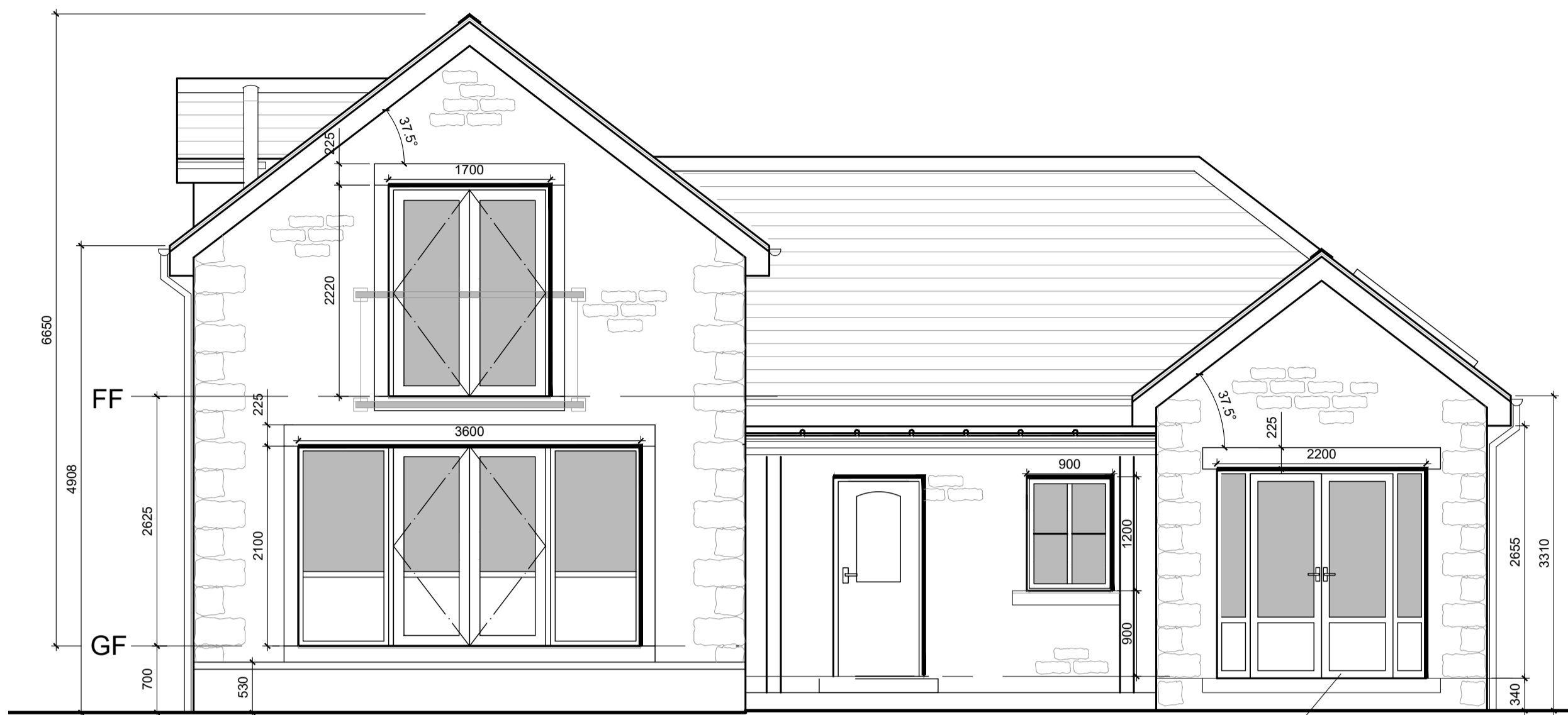
West Elevation 1:50 Scale