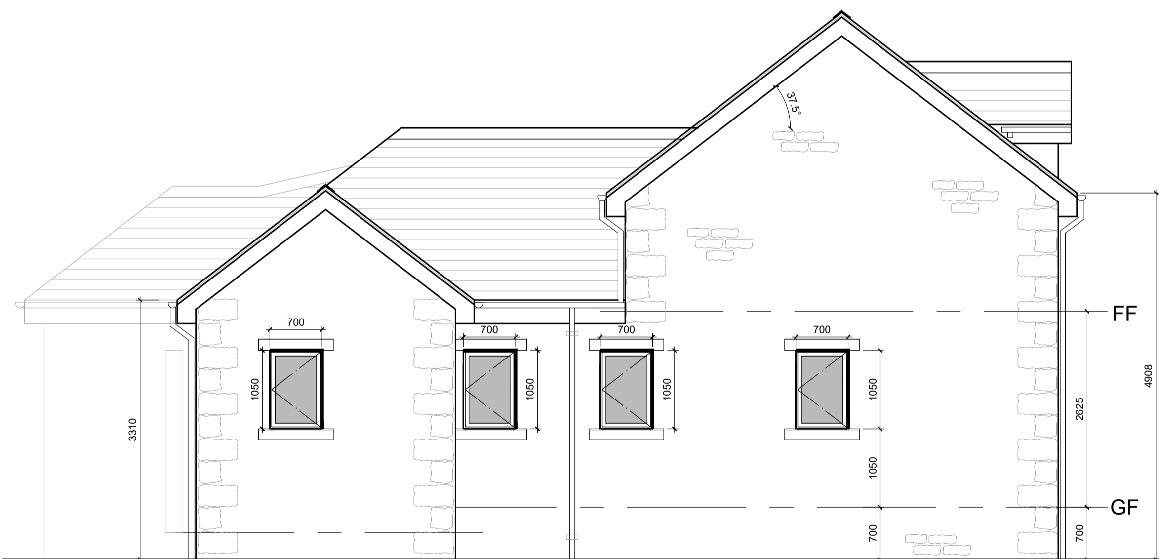
East Elevation 1:50 Scale