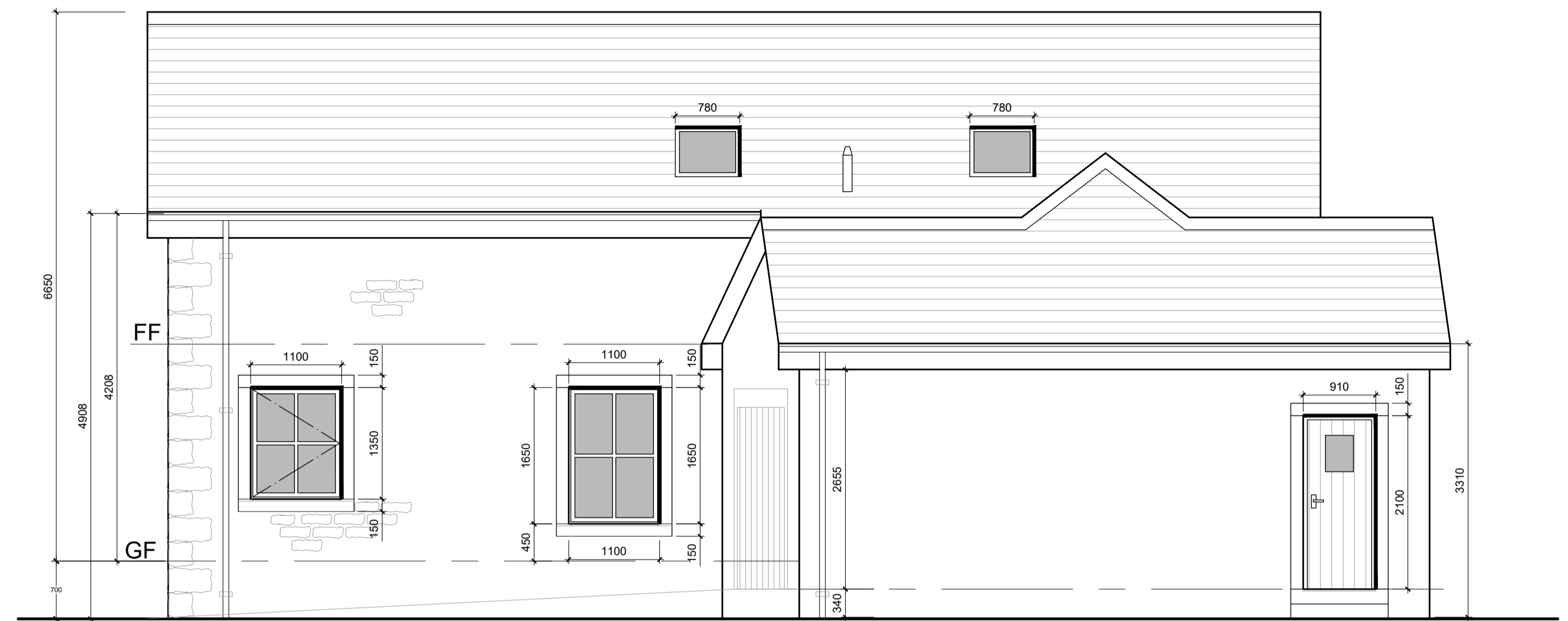
South Elevation 1:50 Scale