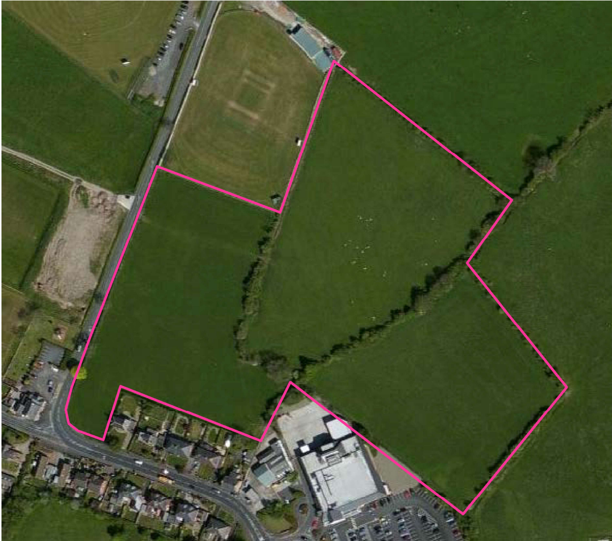
Approximate Phase 1 site boundaries edged in pink