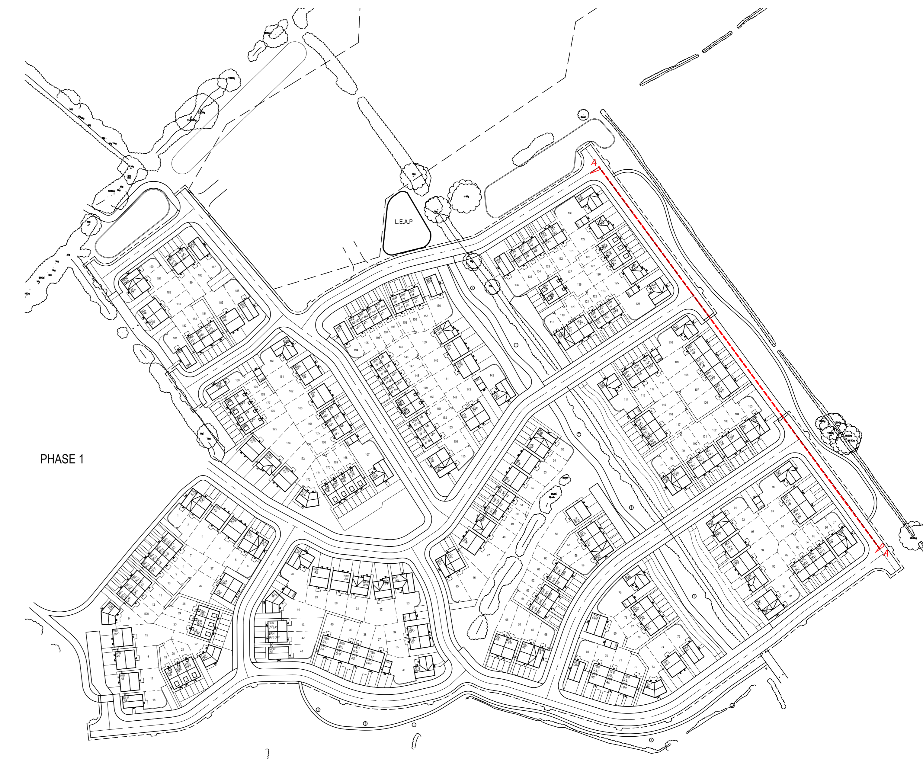
Site Layout (NTS)