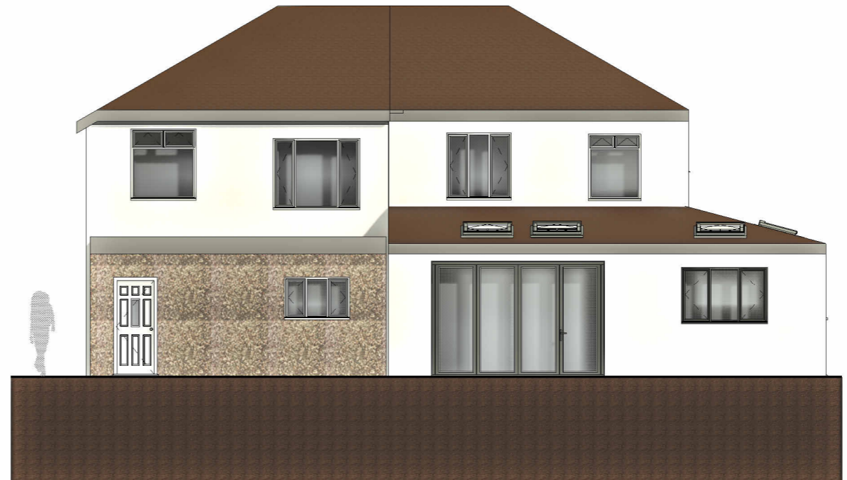
5 EXISTING REAR ELEVATION 1 : 50