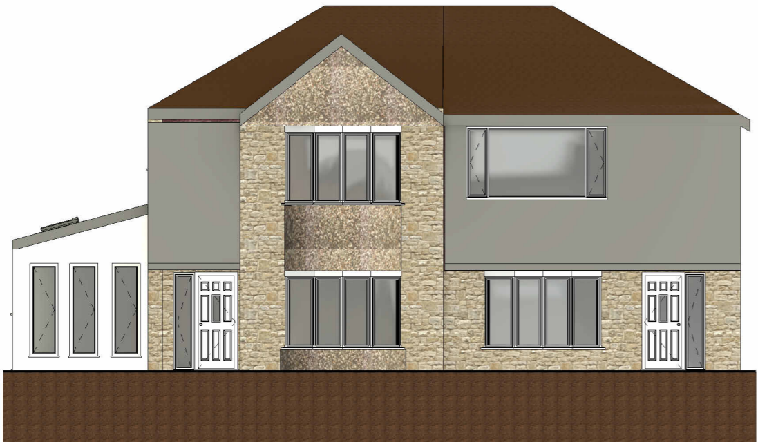
4 EXISTING FRONT ELEVATION 1 : 50