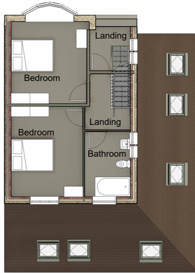
2 1 PROPOSED FIRST FLOOR 1 : 50