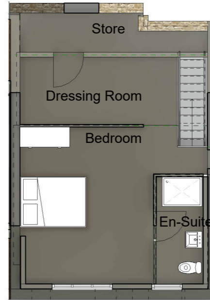
3 2 PROPOSED SECOND FLOOR 1 : 50