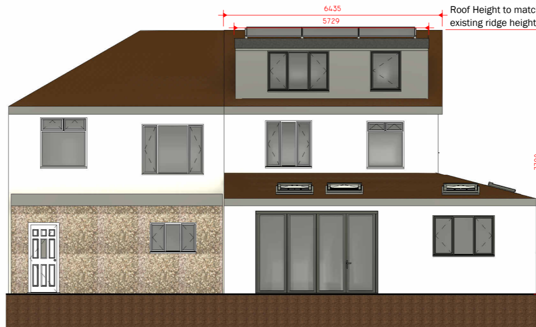
4 PROPOSED REAR ELEVATION 1 : 50