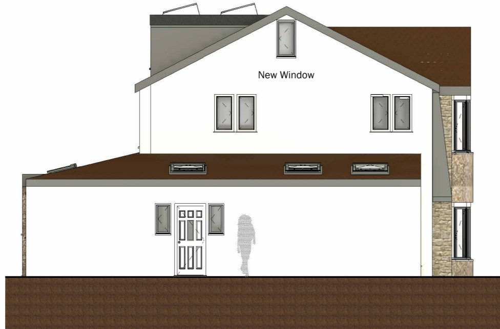
5 PROPOSED SIDE ELEVATION 1 : 50