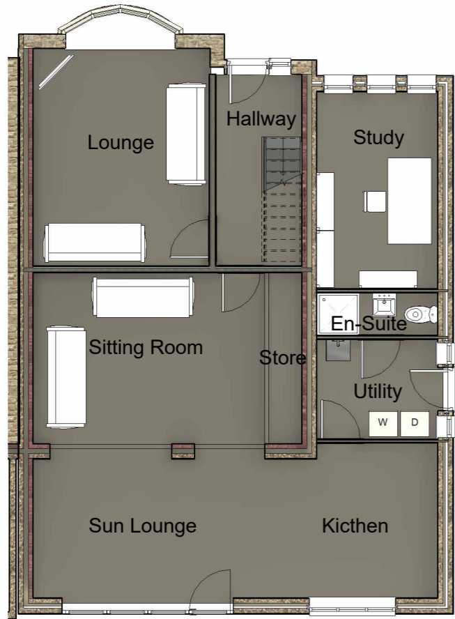
1 0 PROPOSED GROUND FLOOR 1 : 50