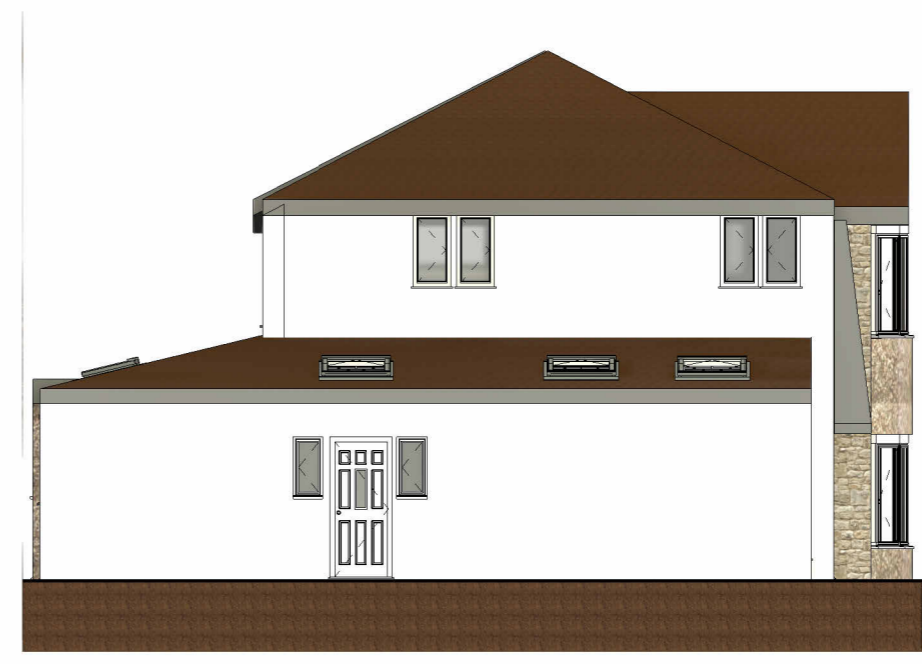
3 EXISTING SIDE ELEVATION 1 : 50