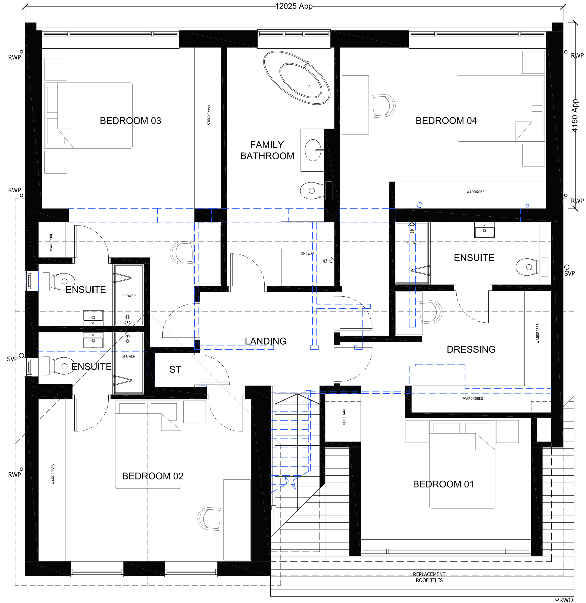
02 FIRST FLOOR GA PLAN AS PROPOSED 1:50