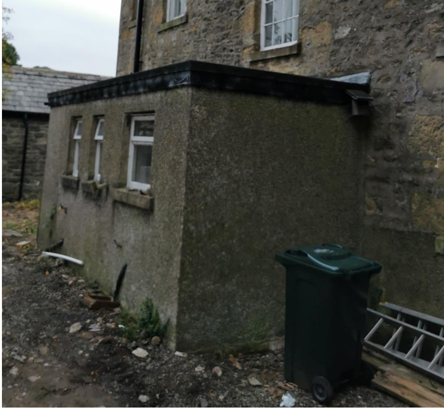
FIGURE 4: IMAGE OF THE EXISTING FLAT ROOF REAR STRUCTURE TO BE REMOVED