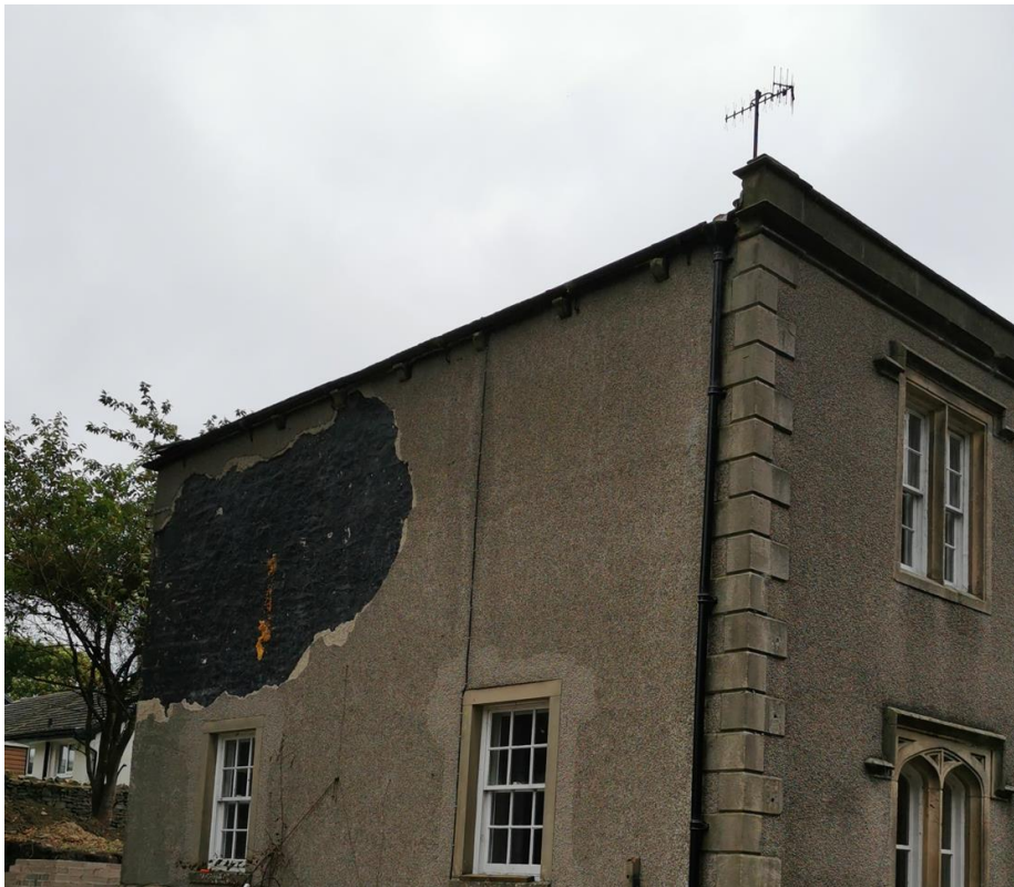
FIGURE 5: IMAGE OF THE SIDE ELEVATION WITH MISSING/DAMAGED RENDER