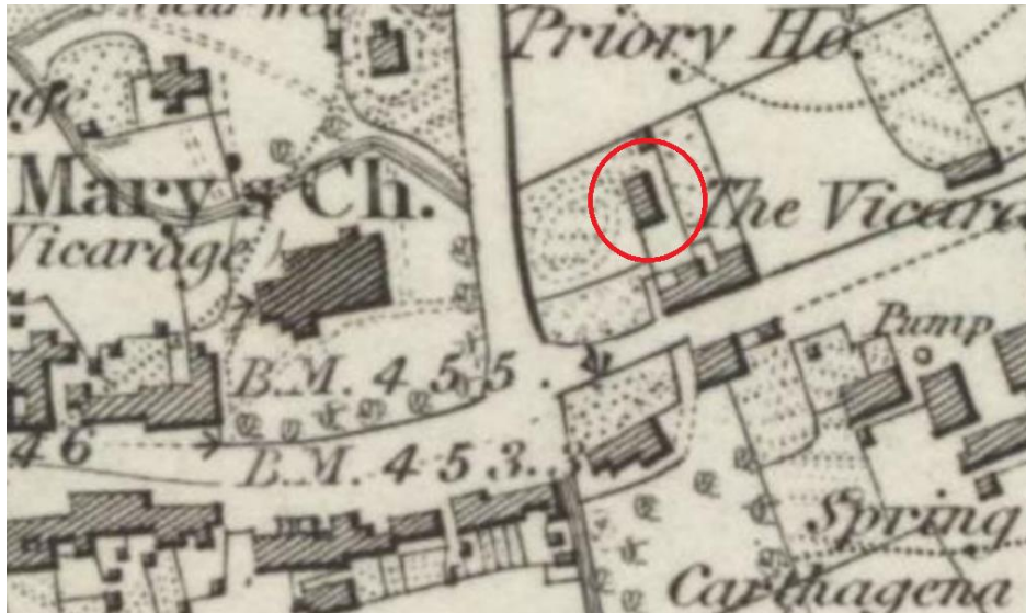
FIGURE 2: EXTRACT FROM HISTORIC OS MAP 1853