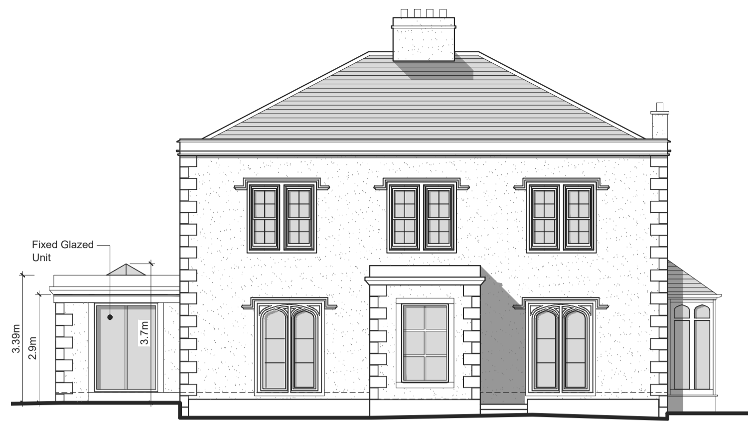
PROPOSED SOUTH WEST ELEVATION Scale 1:100