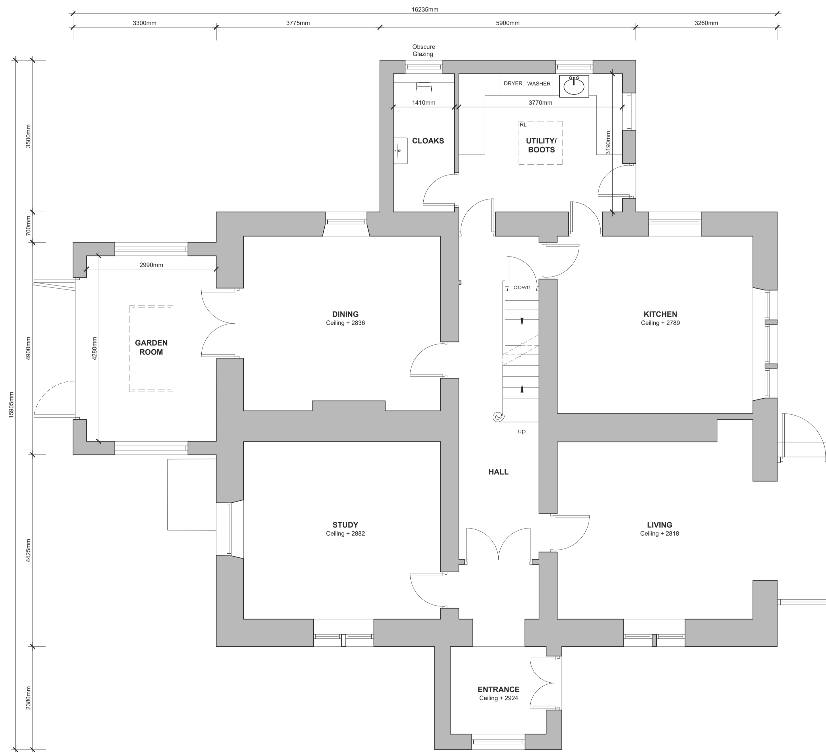
PROPOSED GROUND FLOOR PLAN Scale 1:50