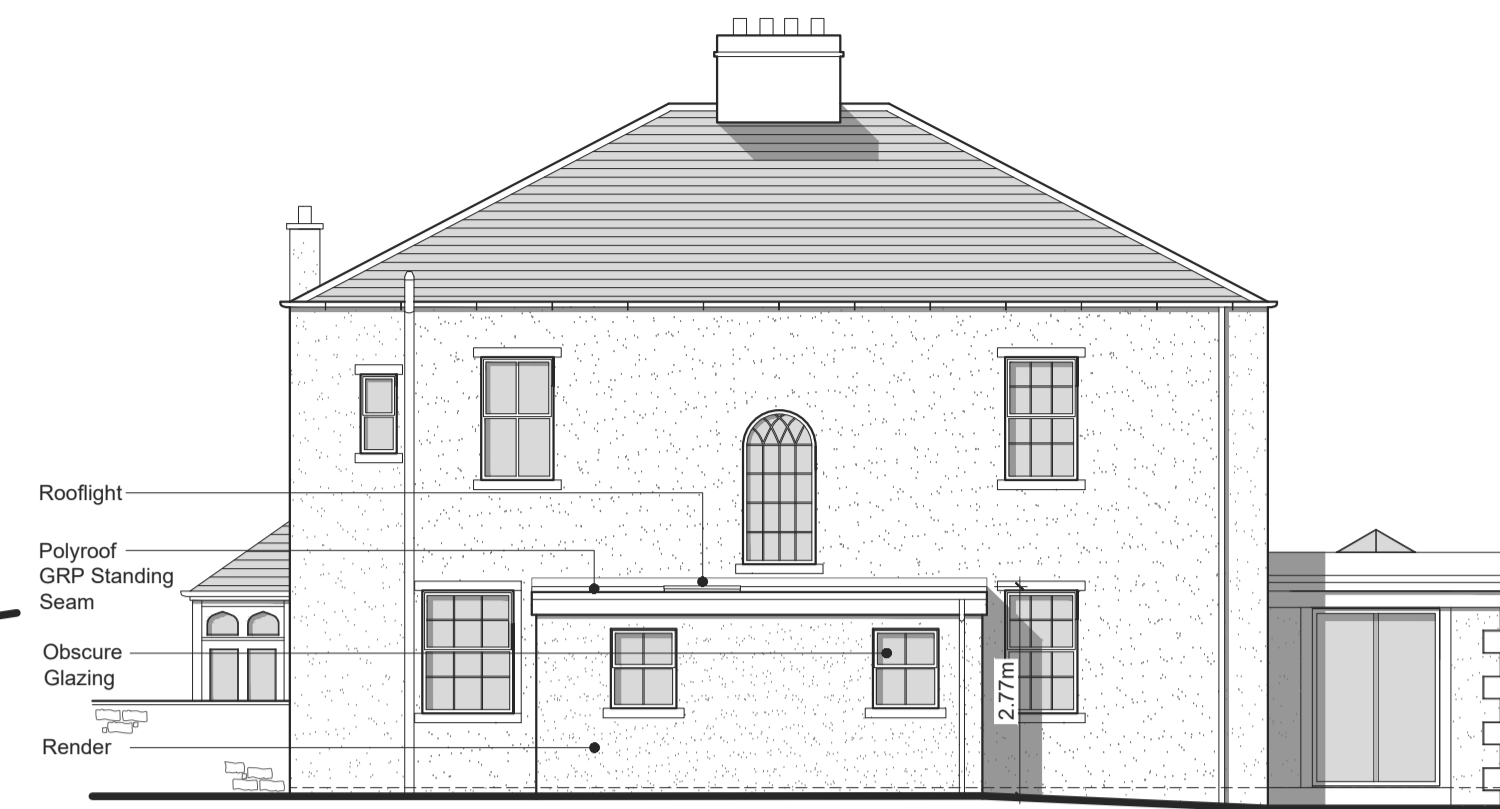
PROPOSED NORTH EAST ELEVATION Scale 1:100