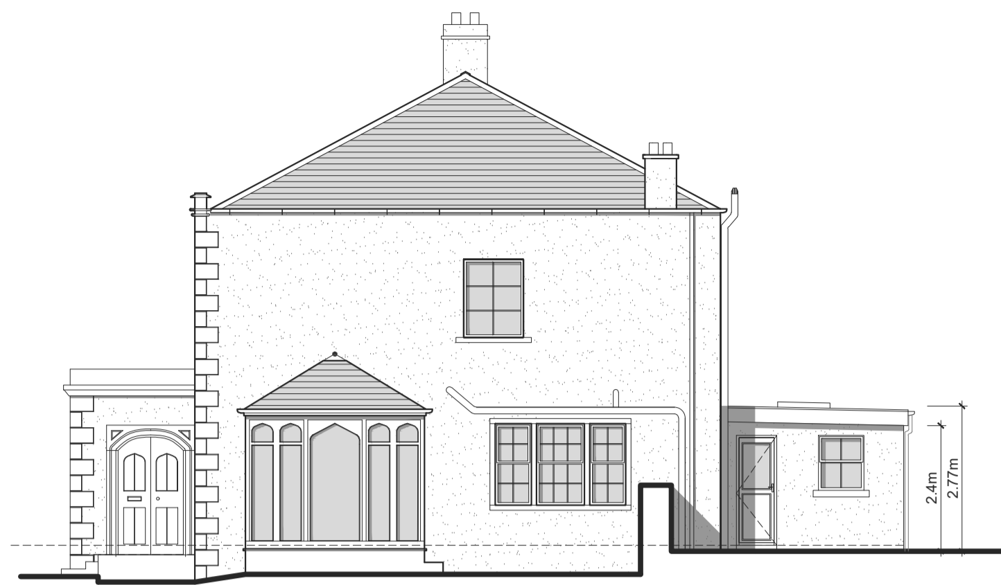
PROPOSED SOUTH EAST ELEVATION Scale 1:100