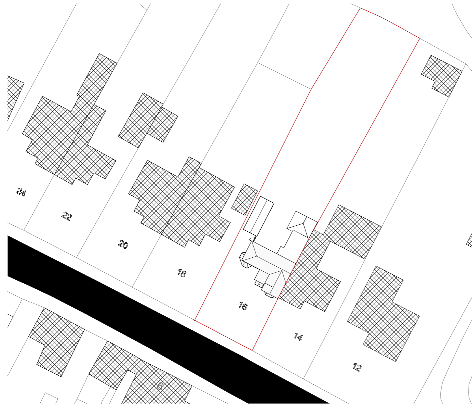
1 EXISTING SITE PLAN 1 : 200