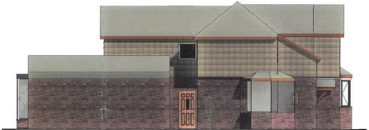
4 PROPOSED WEST 1 : 50