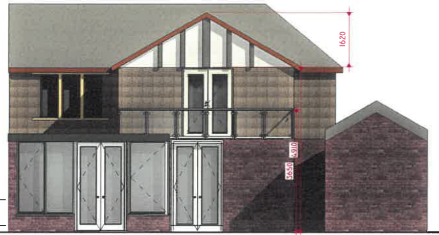
1 PROPOSED NORTH 1 : 50