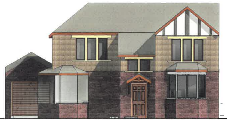
3 PROPOSED SOUTH 1 : 50