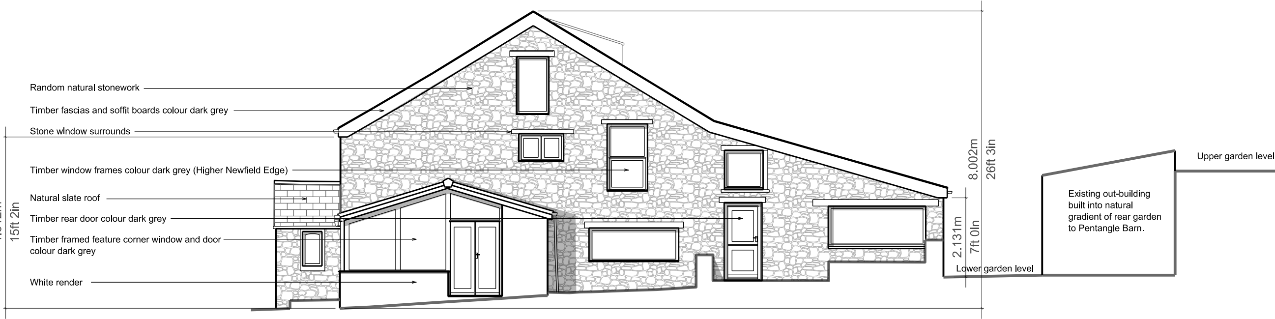
Side Elevation (South-West) Scale 1:100