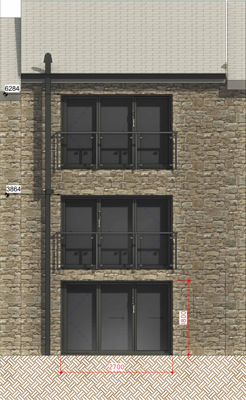
1 PROPOSED REAR ELEVATION 1 : 25