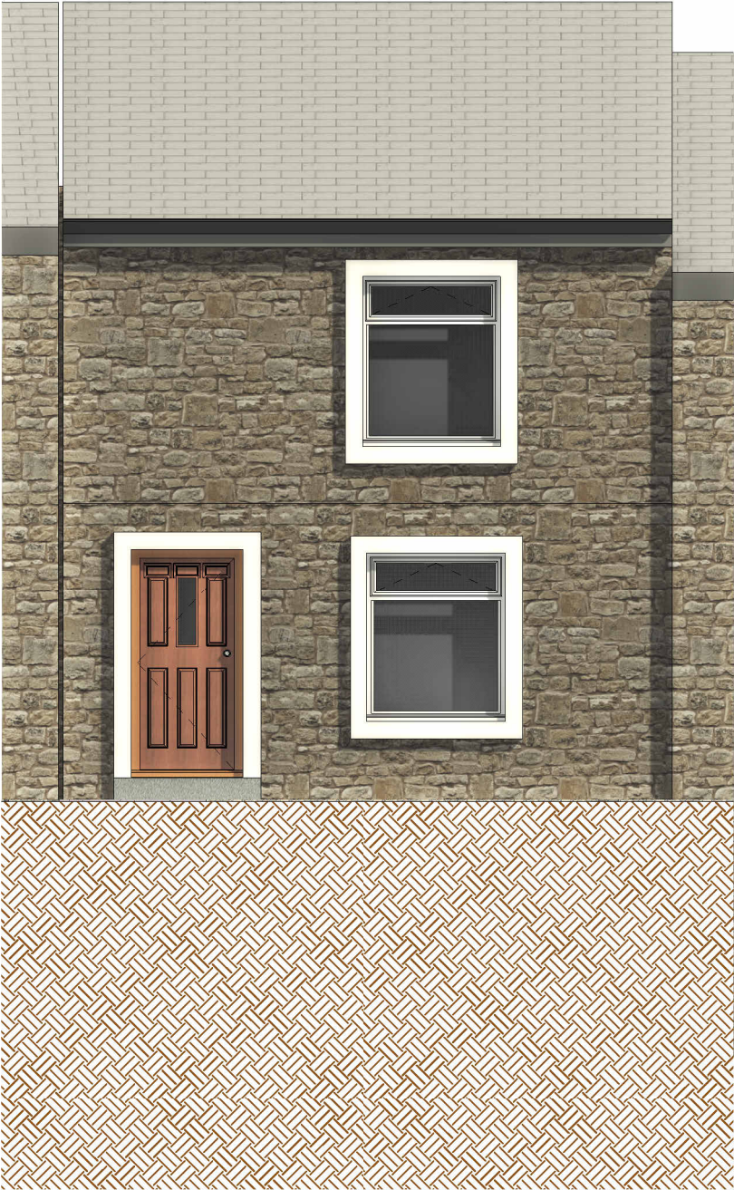
2 PROPOSED FRONT ELEVATION 1 : 25