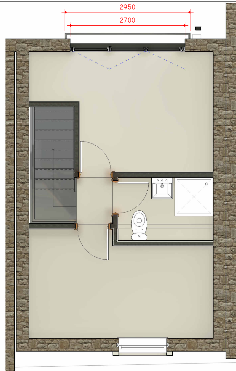
3 2 PROPOSED EAVES 1 : 25