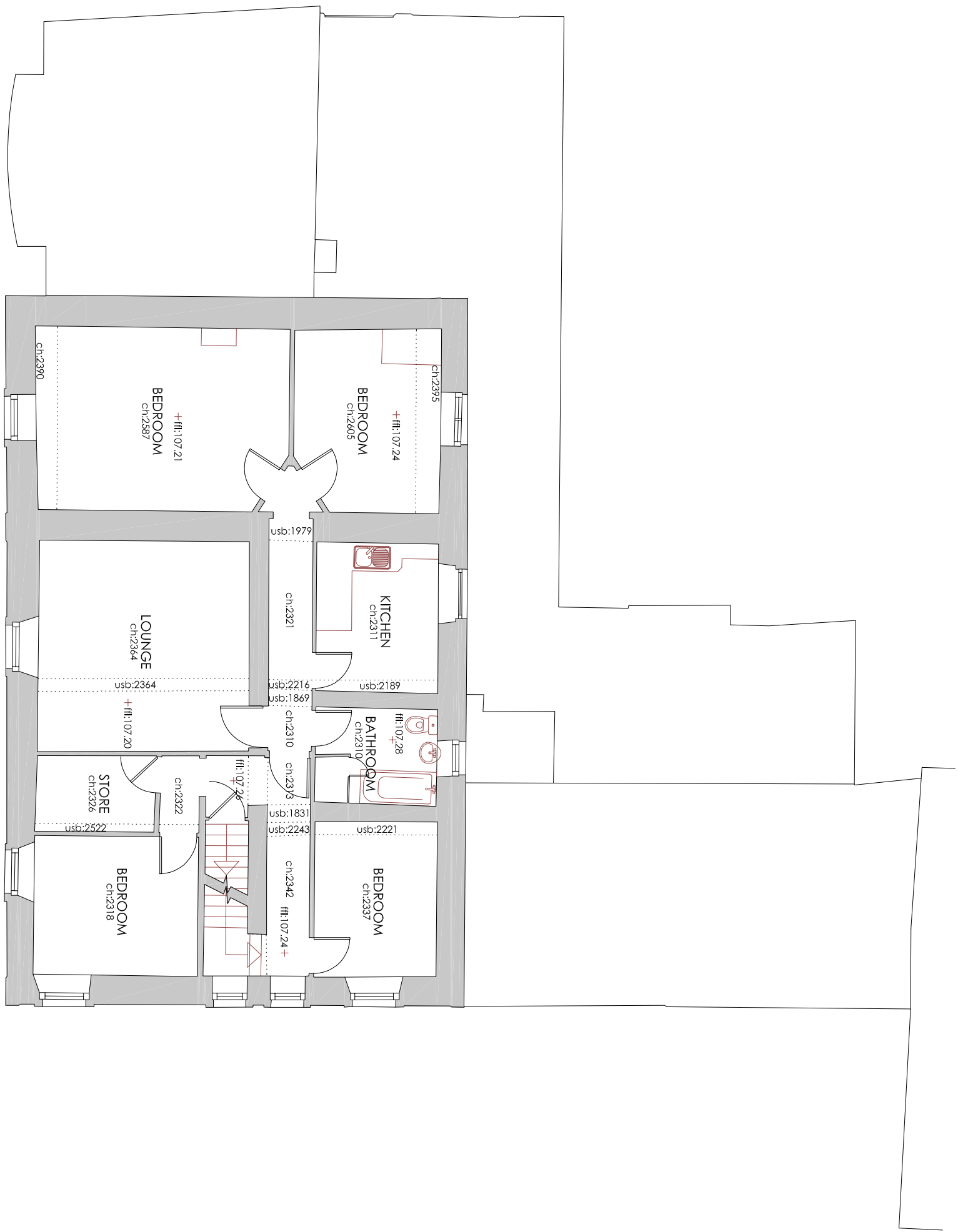
EXISTING FIRST FLOOR