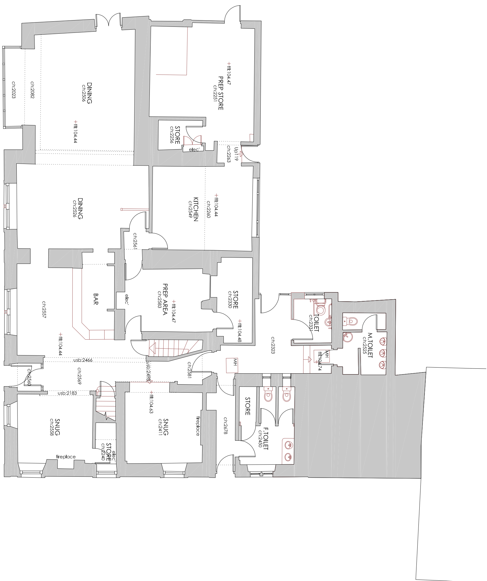
EXISTING GROUND FLOOR