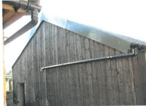
Rear of larger and smaller building

They are in a rural location about 150m from the nearest woodland: