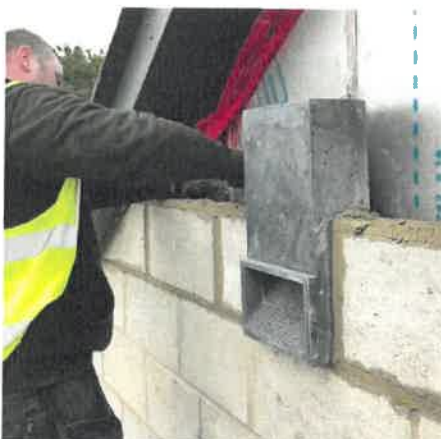
Green and Blue Bat Block/Brick in situ

https://www.greenandblue.co.uk/products/bat-block-bat-brick