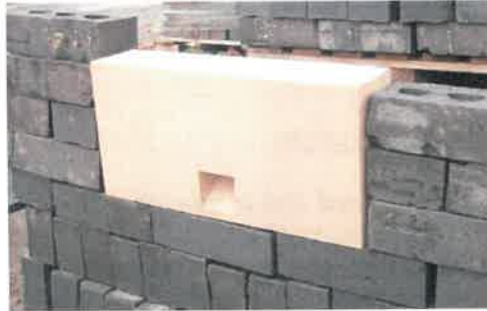
Above and below - standard colours available. Others available to order

Available from https://www.roofingsuperstore.co.uk/product/forticrete-bat-box-colour-match.html