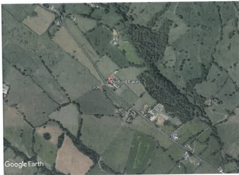
Location of Pinfold Farm

They are in a rural location about 150m from the nearest woodland: