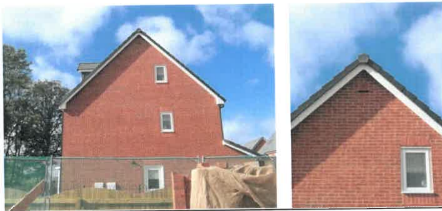
Above: typical unit in situ.