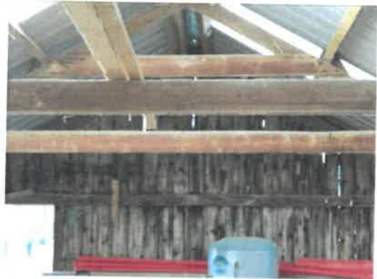
Interior of larger and smaller building

The roof of the larger is of asbestos sheeting, and of the smaller is metal sheeting: