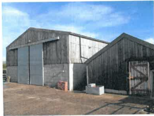
Front of both buildings