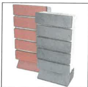
Brick example of Ecosurv Habitat. Can also be faced with stone.

“Designed to be built into an exterior wall and is available in a variety of faces to match the building. Standard facings of red or blue brick - ideal for new builds - are normally available from stock, or boxes can be made to your specific requirements with a face of brick, stone, timber, or plain (for rendering). Supplied unpointed.”