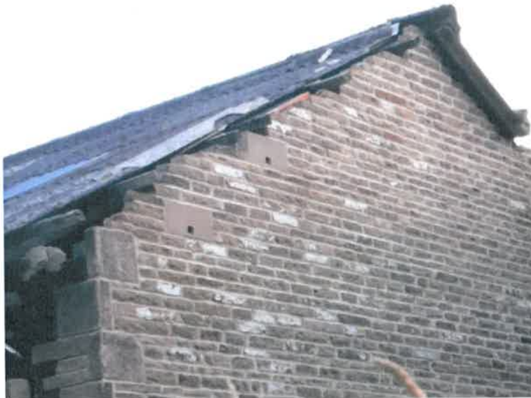
Example of Forticrete boxes in situ