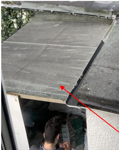
Infill timber roof over open store