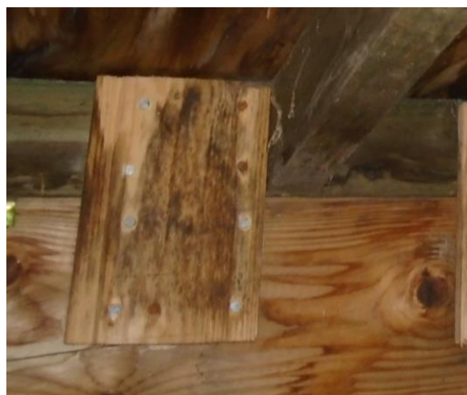
Interior of single skin timber wall to open store