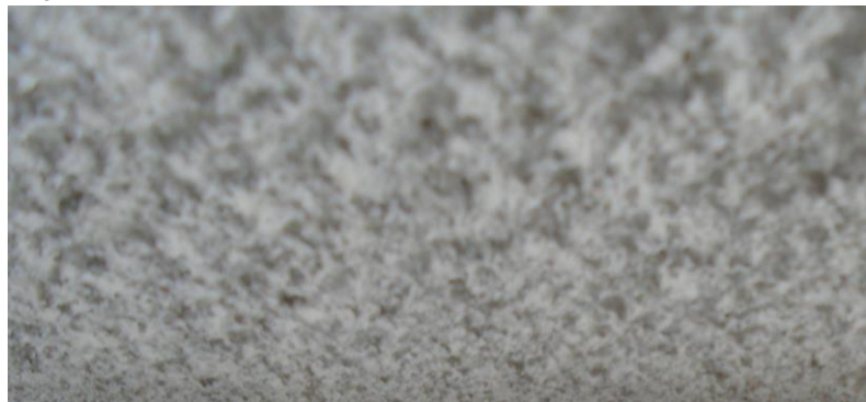
South west elevation