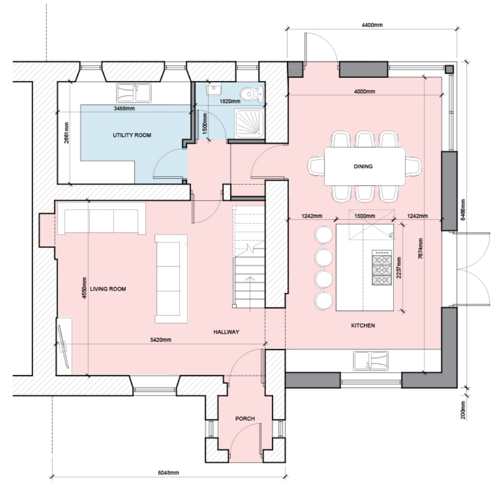
PROPOSED GROUND FLOOR PLAN SCALE 1:100