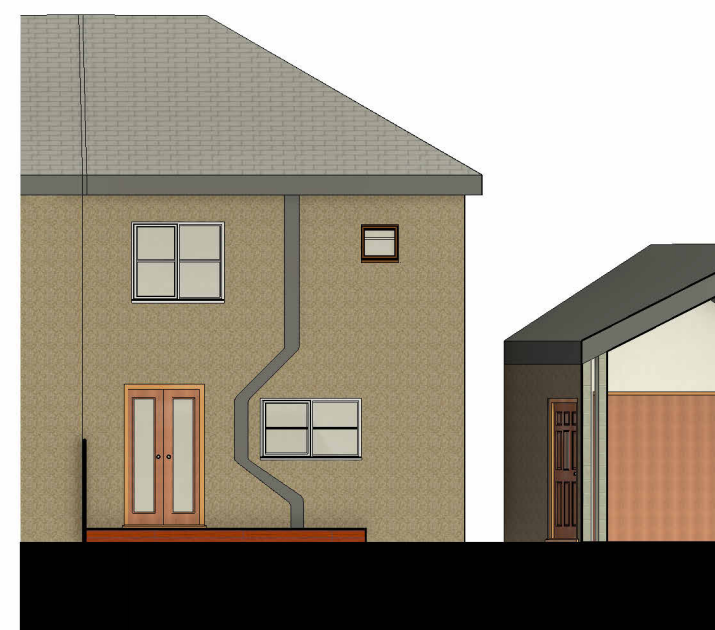
1 EXISTING SOUTH ELEVATION 1 : 50