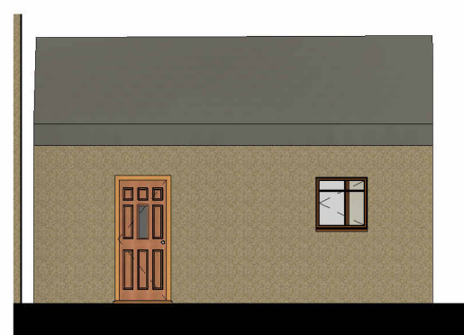
2 EXISTING SOUTH WEST 1 : 50